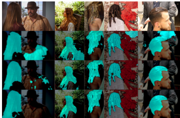
Figure 3: Challenging examples in Figaro1k. First row: Input image. Second row: Segmentation results without detection stage (only Stage2). Third row: Segmentation results by ImageNet pre-trained DeepLabV3+ [3]. Fourth row: Segmentation results by our two-stage model. Many tiny isolated false positives can still be observed on the man’s shirt in the first image of DeepLabV3+ results.

Acknowledgement: This work is sponsored by Région Auvergne-Rhône-Alpes. We are grateful to the NVIDIA corporation for a Titan Xp GPU donation.