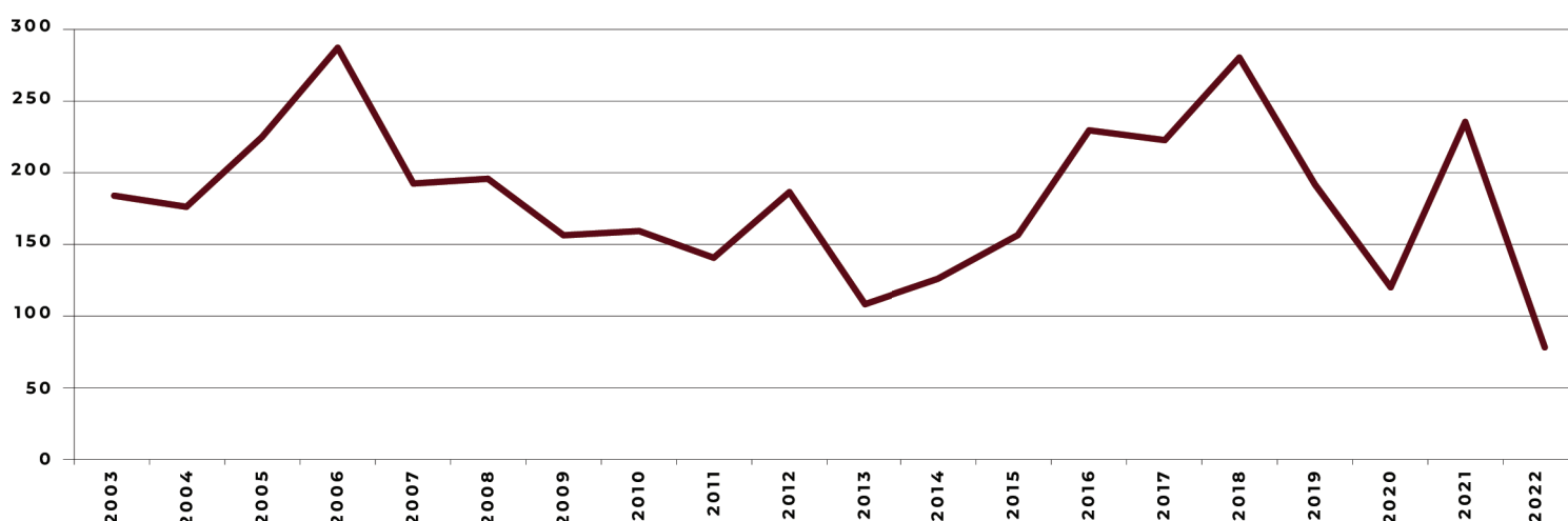
Salmon Industry Production Value, 2003-2022 ($ Million)