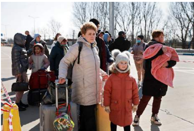
People flee the military offensive in Ukraine, seeking refuge in Moldova or transiting the country on their way to Romania and other EU countries.