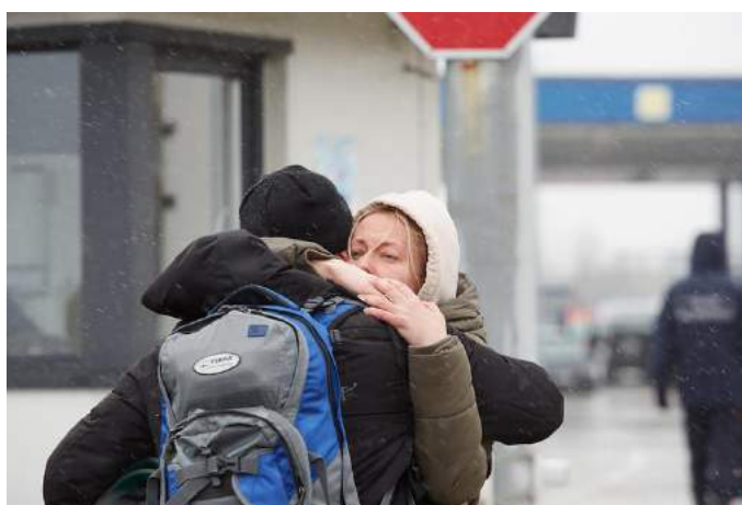
People fleeing the military-offensive in Ukraine on 1 March 2022.

This month, the UNiTE campaign's action circular will focus on the issue of violence against women and girls (VAWG) in the context of conflicts. Gender-based violence (GBV), and particularly VAWG as a form of GBV, is amongst the most pervasive human rights violations in the world and has a devastating impact on the lives of individual women and girls, their families, and communities but it also hampers societies' resilience to crises and disasters, long-term recovery, educational and economic outcomes, and peace itself. It is in times of conflict and war such as the ones we are now witnessing in several corners of the world that different forms of VAWG are exacerbated, not only conflict related sexual violence (CRSV), but also sexual exploitation and abuse (SEA), intimate partner violence (IPV), child marriage and trafficking in persons 1 .