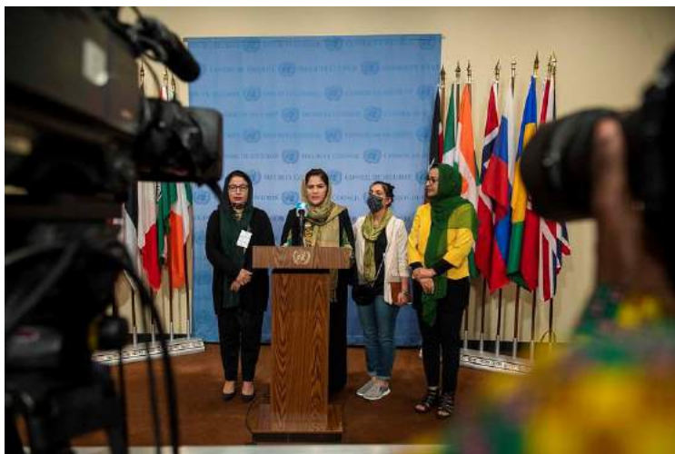
Afghan women leaders at the UN Headquarters in October 2021

In Afghanistan , given the complex and quickly evolving operating environment, the Spotlight team together with local civil society adapted implementation modalities and interventions which allowed the team to continue to conduct advocacy with the de facto authorities, emphasizing the importance of continuing gender-based violence services.