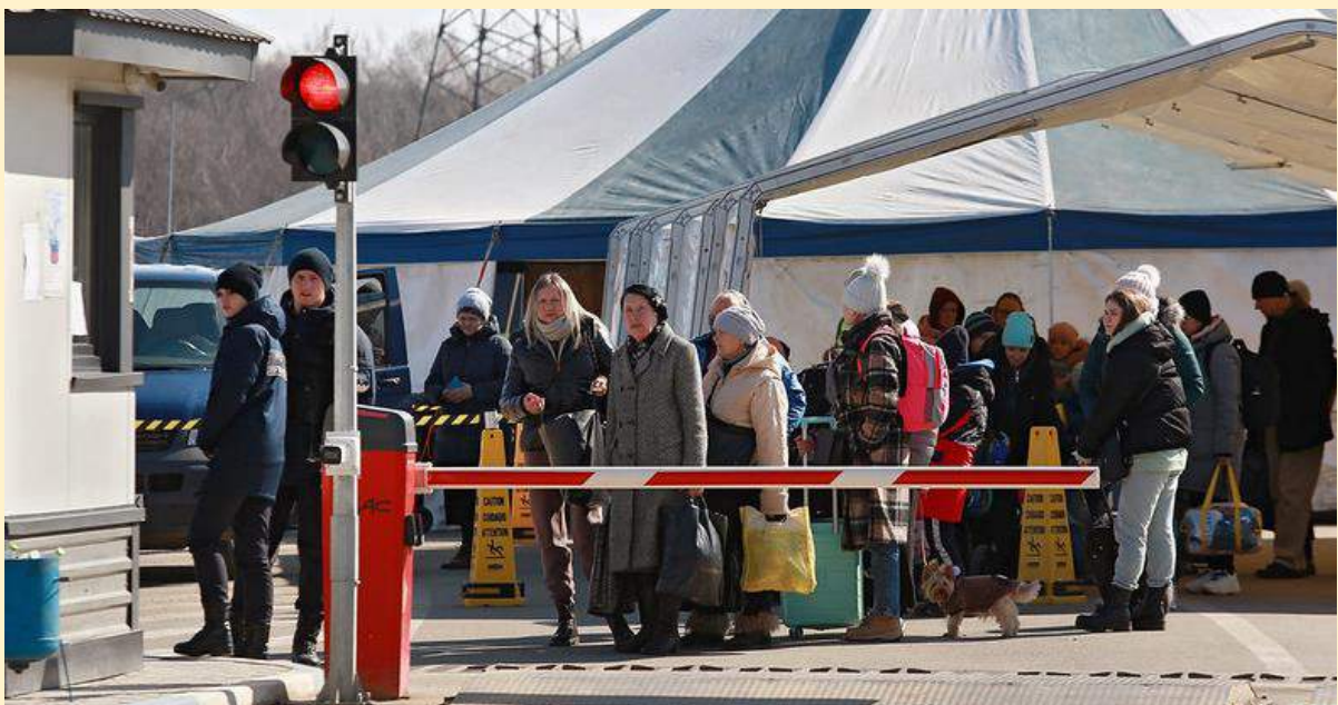
A scene from the Palanca-Maiaki-Udobnoe border crossing point, between the Republic of Moldova and Ukraine on 15 March 2022.