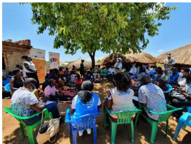
An image from the Spotlight Initiative programme in Uganda

In Uganda , SI supported the launch of the Africa Women Leaders Network (AWLN) Uganda Chapter , which aims to enhance the leadership of women in the region and has been critical to localizing UN Security Council Resolution 1325 on Women, Peace and Security. SI also works in refugee contexts, and through the rollout and scale up of the SASA! programme, supported an increase in reporting on intimate partner violence and child marriage.