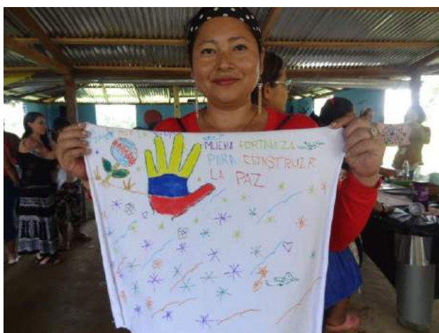
Scenes from a UN verification Mission in Colombia.

As part of the UN Working Group on Hate Speech, DPPA has been contributing to the Office of the Prevention of Genocide's development of the UN guidance note on gender-based hate speech, which will be launched in 2022 . The Guidance Note would provide an overview of what gender-based hate speech is, the normative framework addressing it, and makes recommendations to support country-level programming to prevent, address and counter gender-based hate speech. It highlights how gender-based hate speech is a common precursor to atrocity crimes; forms part of violence against women in political and public life; and is used to disseminate violent extremist ideologies.