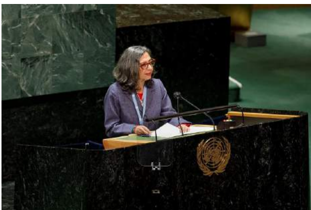
Gladys Acosta Vargas, Chairperson of the Committee on the Elimination of Discrimination against Women addresses the opening session of the Commission on the Status of Women