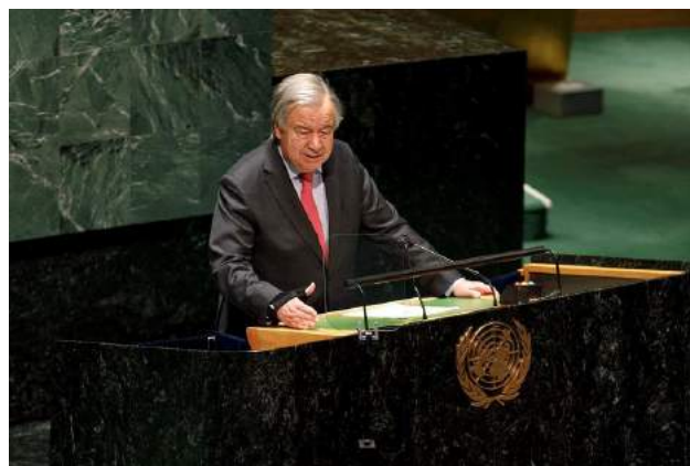
United Nations Secretary-General António Guterres addresses the opening session of the Commission on the Status of Women.