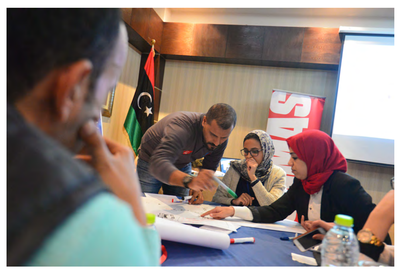
UNMAS convenes stakeholders in Tripoli to work on victim assistance responses.

Government. Training to the Ministry of the Interior encompassed explosive ordnance first response, EOD, IEDD, as well as courses on the use of drones in surveying and clearing land. For the first time, UNMAS delivered a series of mixed explosive hazard first-responder training courses to Iraqi police - an initiative that served to enhance skills in IED threat mitigation and response. Also, since the training was open to both women and men, it helped to create career opportunities for women in a male-dominated field. UNMAS advice and support in Nigeria propelled government-led efforts to establish a mine action strategy and develop national mine action standards. Training to Nigerian police and security forces, and civil defence personnel has also strengthened national capacity in the area of EOD and first response to explosive