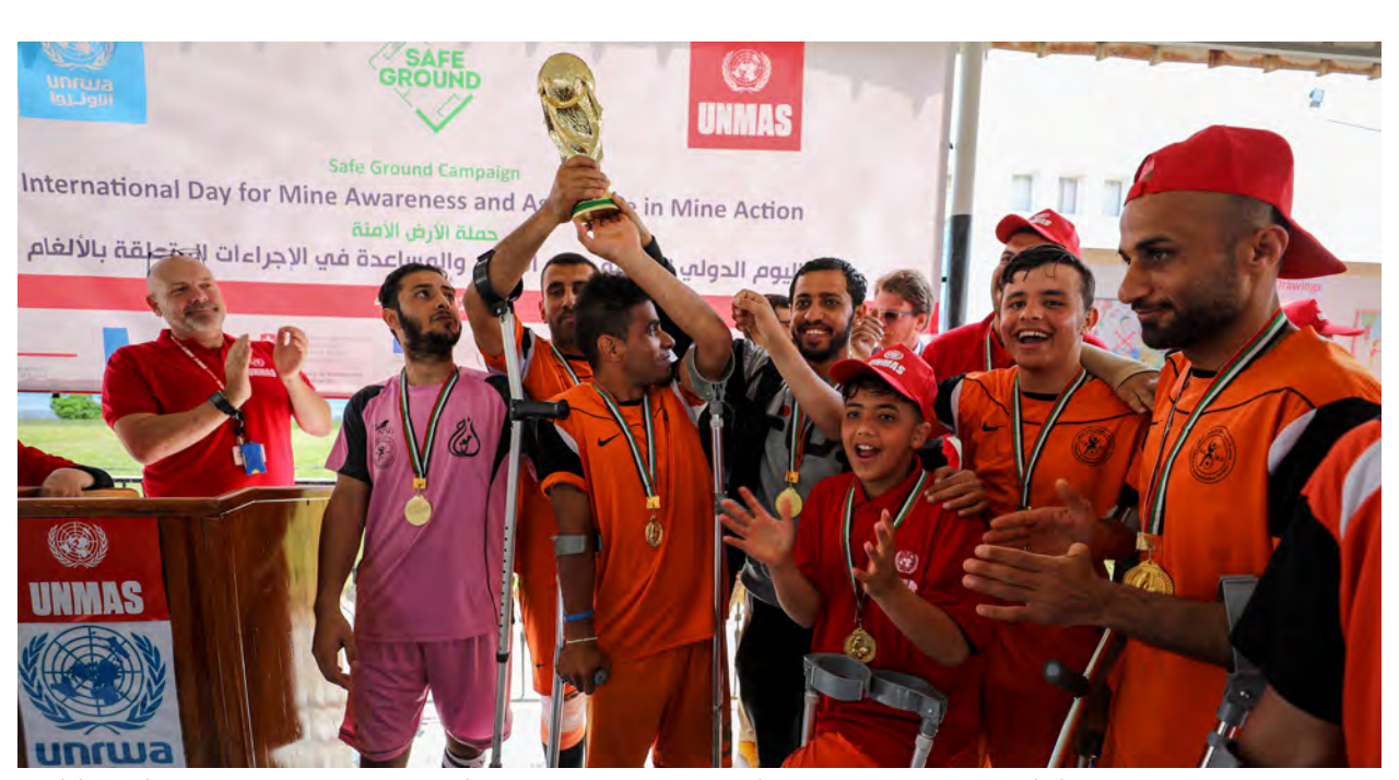
Participants in the football tournament organized by UNMAS and the Palestine Amputee Football Association, as part of the Safe Ground campaign, International Day for Mine Awareness and Assistance in Mine Action, April 2019. UNMAS Palestine

In Colombia, a university panel discussion brought together academics, United Nations actors and civil society representatives to discuss the complex needs of survivors of explosive incidents and the challenges in promoting survivors' rights. Some of the interactive initiatives organized in Iraq included photo exhibitions, documentary screenings, risk education theatrical plays, and "safe runs" around camps for internally displaced persons.