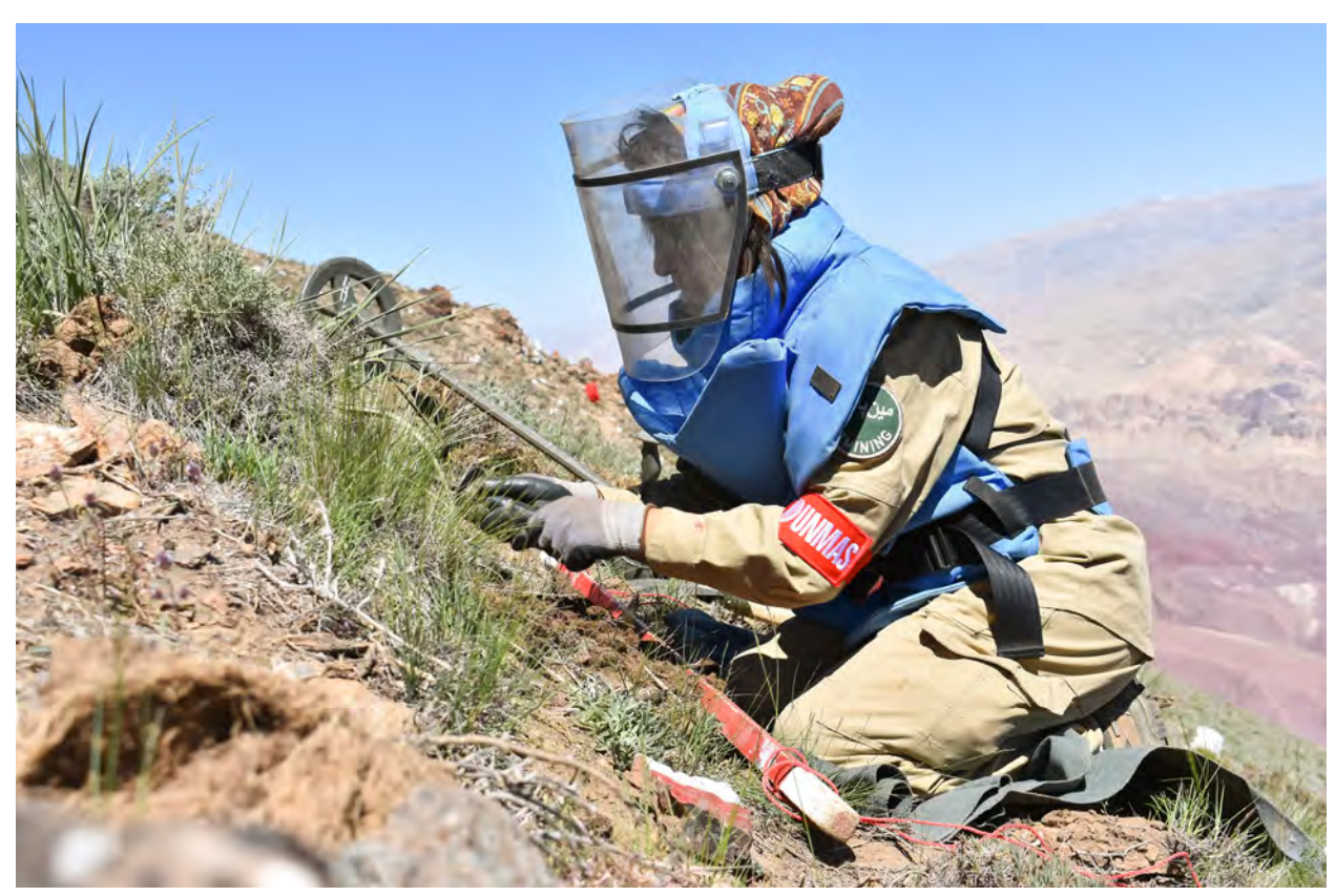
One of the first female deminers in Afghanistan clears mines in Bamyan Province, Afghanistan. DDG

casualties. UNMAS also focused on mitigating the risks posed by poorly secured/managed explosive materiel. As in previous years, that work was complemented by efforts to strengthen mine action coordination among United Nations, national and international partners, and to develop the capacity of local and national actors, pursuing the goal of phasing out United Nations assistance. In 2019, UNMAS continued its work in Afghanistan, Colombia, Democratic Republic of the Congo, Iraq, Libya, Mali, Nigeria, State of Palestine, Somalia, South Sudan, Sudan, Syrian