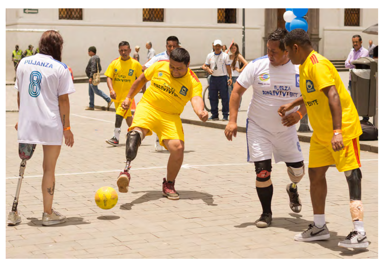
Civilian and military survivors play football in the main square of Popayan, Colombia, during the commemoration of International Mine Awareness Day. Angélica Collazos

stakeholders in the disability sector, including civil society actors, together in order to catalyse cooperation and increase the network of support available to the country's Directorate of Mine Action Coordination, while promoting the inclusion of persons with disabilities, for example through awareness-raising campaigns on the rights of persons with disabilities. Moreover, UNMAS assisted in the development of the first draft of Afghanistan's new Disability Strategy, which aims to ensure that the specific needs of women, girls, men and boys are considered by actors within the sector. In Libya, UNMAS coordinated a stakeholder analysis of victim assistance, bringing together national and international entities, survivors and persons with disabilities to inform the ongoing