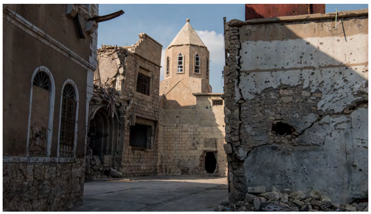
The Al Maedan District, West Mosul, is one of the most damaged and heavily contaminated areas in Iraq. The area is teeming with explosive hazards, in particular IEDs, left behind following the conflict.

by local communities in a way that mainstreams gender considerations.