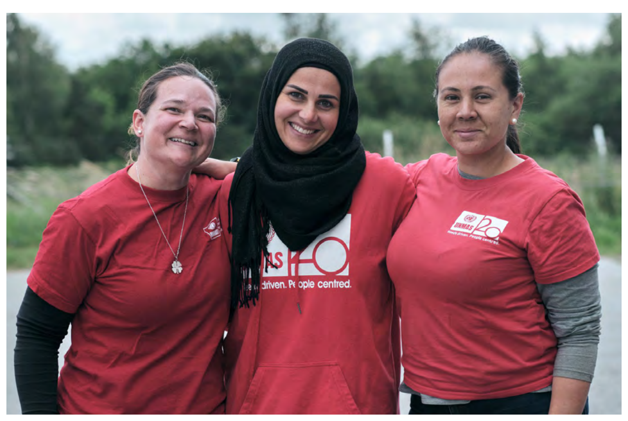
UNMAS officers celebrate the successful completion of EOD Level 3 training in Denmark.

and technical training to the only female demining team in Afghanistan. In April 2019, the team started its second clearance project in Bamyan and released an additional 61,344 square metres of land, thereby contributing to making Bamyan the first province to be declared free of all known minefields. Beyond the provision of immediate life-saving assistance, the women set an example through their meaningful and impactful participation in mine action, and have served to demonstrate alternative livelihood pathways for women in Afghanistan. In Iraq, the very first mixed team of searchers was established by UNMAS in Sinjar. Emblematic of the role of mine action in dismantling gender and other social barriers,