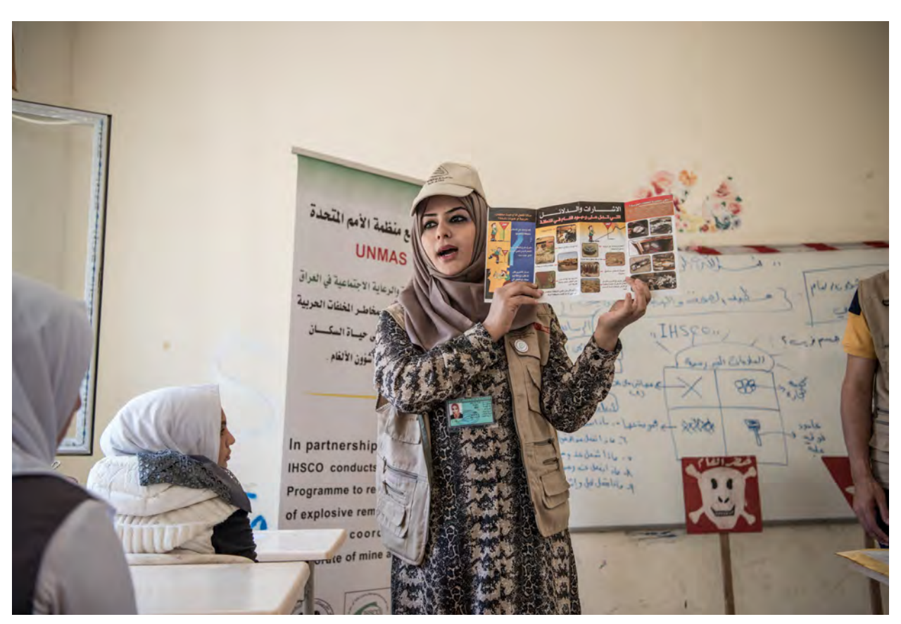
UNMAS partners provide risk education on explosive hazards at a school in Mosul, Iraq.