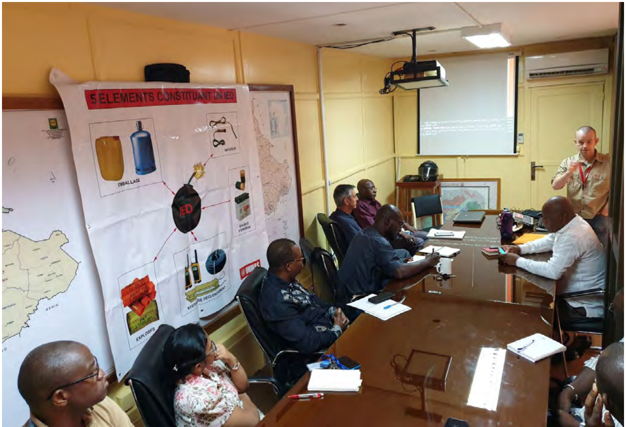
UNMAS trains members of the United Nations Country Team in Burkina Faso on IED risk mitigation.

The rapidly deteriorating security situation in Burkina Faso, involving persistent armed attacks in the northern and eastern regions of the country since 2016, has had serious humanitarian consequences. In September 2019, at the request of the United Nations Resident Coordinator, UNMAS deployed teams to Ouagadougou. With a clear escalation in the number of IED incidents in the past two years (an increase from one to 61 between 2016) and 2019), the country is facing a new threat that needs to be addressed. UNMAS projects fell under two areas of work: facilitating humanitarian responses, including through the sensitization of affected communities and humanitarian workers, and supporting national security forces in relation to explosive ordnance. During the first five months of its presence in the country, UNMAS conducted sensitization sessions for 249 humanitarian personnel (38 women and 211 men) in five regions; strengthened the protection sector, which contributed to improved integration of mine action into relevant humanitarian plans; and started working with the National Commission on the Fight Against Small Arms Proliferation to develop national standards for the coordination of risk education activities. also established working relationships with national actors, including the Ministry of Security, conducted sensitization sessions and delivered IED-response training and equipment to security forces and humanitarian personnel.