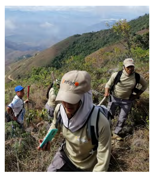
Non-technical survey teams identify and map hazardous areas in Colombia, UNMAS

to prevent future occurrences of such incidents. In pursuit of the goal of full transition of mine action responsibilities to national authorities in approximately five years, UNMAS efforts in South Sudan continued to build the capacity of the country's National Mine Action Authority, including through on-the-job technical training, workshops on resource mobilization and project management, and quality assurance mentoring at field sites. UNMAS trained, mentored and equipped explosive ordnance and IEDD teams in Somalia to assist in clearing land and saving lives. That ongoing capacity-building has produced results; for example, with the support of UNMAS, small amounts of explosives have been handed over by the Sanctions Committee for Somalia to the Somali Police Force, for disposal. In the Democratic Republic of the Congo , a national commission established with UNMAS support coordinated, monitored and evaluated the implementation of the country's National Action Plan for Small Arms and Light Weapon Control (2018-2022). In Colombia, UNMAS continued to provide technical assistance and training to all mine action operators, enhancing