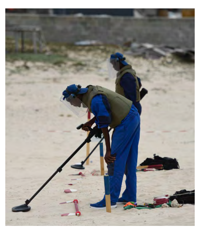
UNMAS trains locals from affected communities to identify and safely remove ERW in Somalia. UNMAS

for Sustainable Development at the national and local levels. In Iraq , UNMAS formed its first mixed-gender team of explosive ordnance searchers and ensured that survey and disposal activities led by partners benefited from gender-sensitive response training, thereby clearing land for use