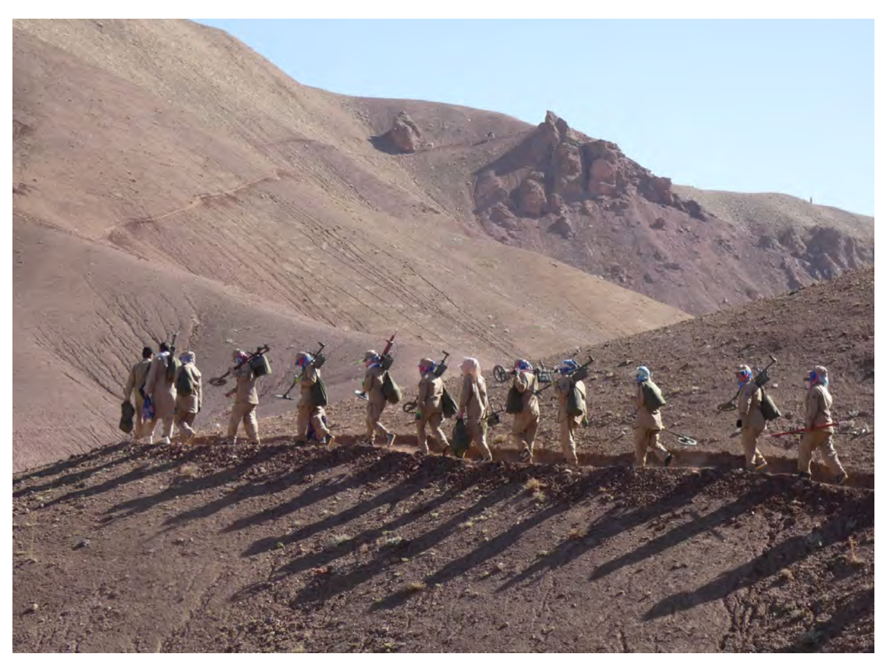
Afghan female deminers in Bamyan Province, Afghanistan. UNMAS

Consideration of diverse and at-risk groups further influenced UNMAS risk education