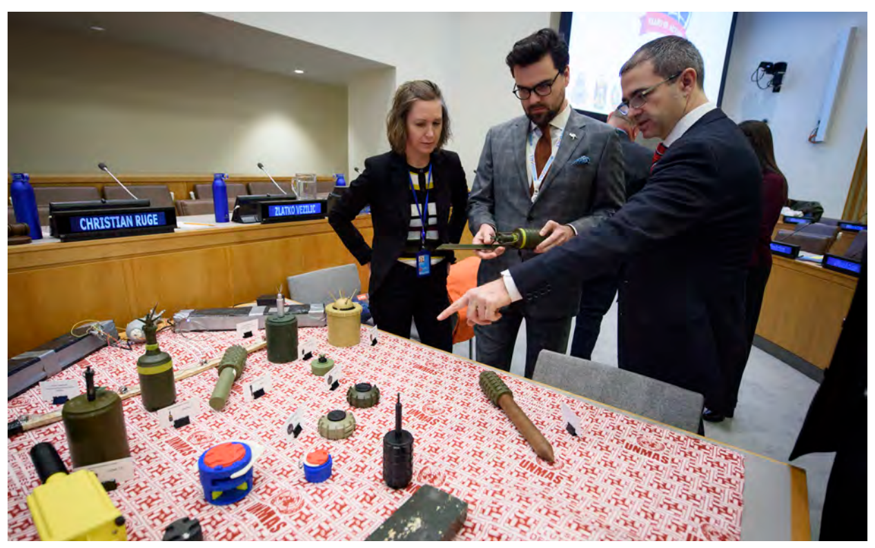
Delegates at UNMAS event "A World Free of Mines: For a Safer Tomorrow", 20th anniversary of the entry into force of the Mine Ban Treaty.

led by the respective presidencies. UNMAS also coordinated the contribution of IACG-MA to the Annual Meetings of the High Contracting Parties to the Convention, to Protocol V and to Amended Protocol II. Throughout 2019, UNMAS continued to leverage its role as the global coordinator for mine action to promote universalization of the Convention on Cluster Munitions, which entailed support to the Annual Meeting of States Parties to the Convention on Cluster Munitions, using its platform to express concerns over the alleged use of cluster munitions, and to reinforce the stigma surrounding their use. Moreover, promotion of the Convention on the Rights of Persons with Disabilities and the urgent need to do more and better for survivors of explosive ordnance were key messages relayed throughout UNMAS advocacy work in 2019. The commitment of UNMAS to prioritize Victim Assistance was reflected in the launch, in April 2019, of the Safe Ground campaign, a United Nations-led campaign to raise awareness about the impact of explosive ordnance on individuals and communities, and to