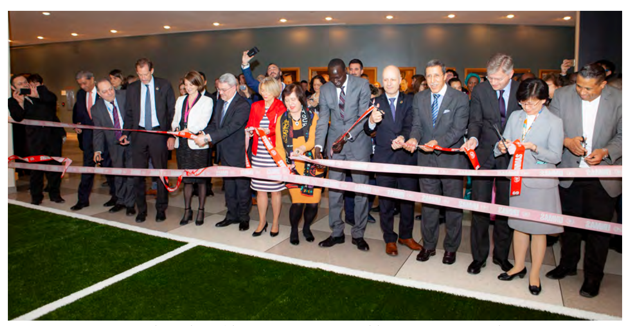
Member States delegates and United Nations officials open the "Safe Ground" exhibit at UNHQ, New York, 4 April 2019.

Ground, which aims to turn minefields into playing fields. The Secretary-General launched the five-year campaign to raise awareness and resources for victims and survivors of armed conflict. The campaign complements the United Nations Mine Action Strategy 2019-2023, and specifically supports its Strategic Outcome 2 on caring for survivors of explosive accidents and their families. The Safe Ground campaign will leverage partnerships with Member States, donors, civil society, sports federations and the private sector.