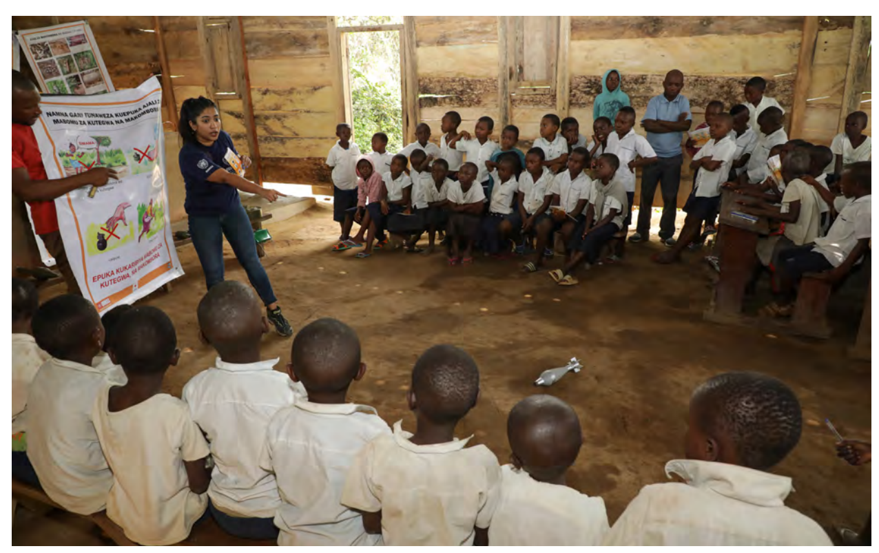
UNMAS provided risk education in a school in Mavivi, Beni district, Democratic Republic of the Congo.

Explosive ordnance risk education continued to be deeply embedded in UNMAS activities. Behaviour change messages and communication are tailored to specific audience groups, namely women, men, girls, boys and displaced or nomadic communities, among others. In Iraq, risk education took various formats in order to increase outreach, for example through billboards, TV clips, virtual reality goggles, branded products for United Nations implementing partners and targeted events, among others. UNMAScoordinated explosive ordnance risk education in Nigeria specifically targeted internally displaced persons, host communities, refugees and returnees, which led to an increase in reporting of the presence of explosive ordnance. To improve the safety of families and individuals displaced at the onset of fighting in Tripoli, Libya, UNMAS