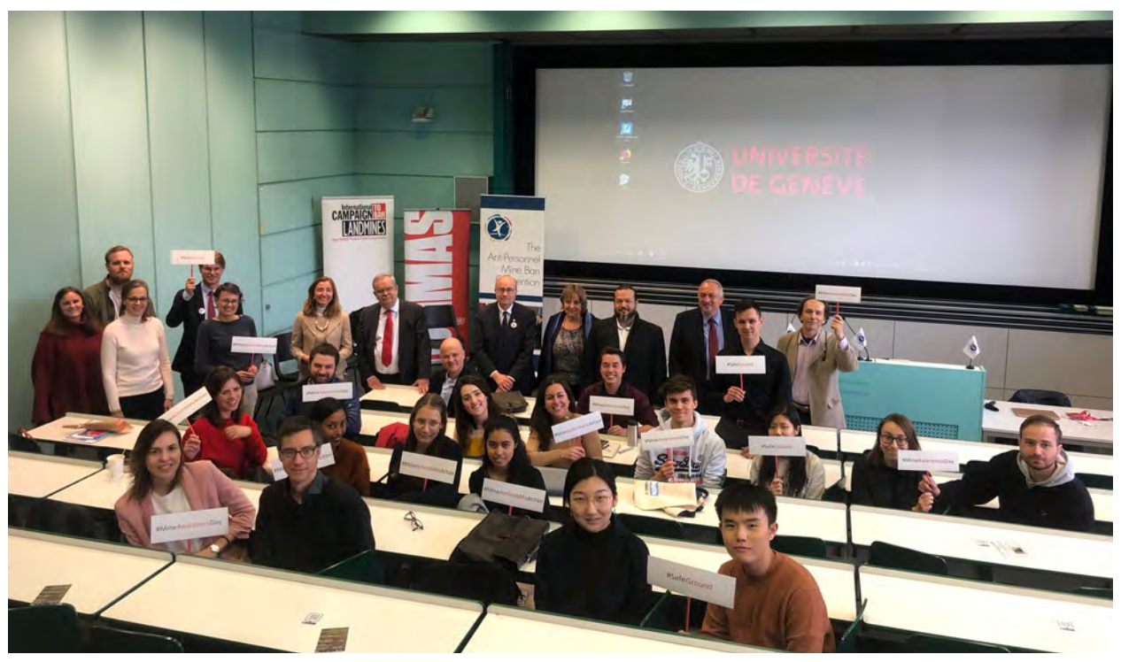
Participants and speakers at an interactive panel discussion at University of Geneva on the International Day for Mine Awareness and Assistance in Mine Action, April 2019.

UNMAS actively engaged in the Group of Experts meetings on Protocol V on Explosive Remnants of War and on Amended Protocol II on Mines, Booby-Traps and Other Devices to the Convention on Certain Conventional Weapons, supporting the technical discussion and universalization efforts