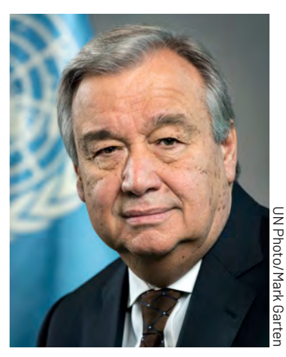
António Guterres, United Nations Secretary-General

The successes of mine action show how we can achieve the seemingly impossible when we work together towards common goals. That is a valuable lesson for all, as we focus on suppressing the transmission of COVID-19 and recovering from its impact.