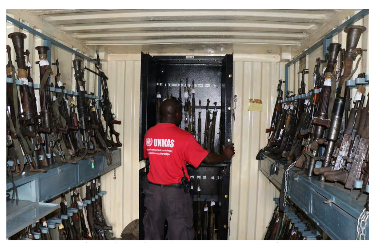
UNMAS creates safe gun solutions for national security forces in Goma, North Kivu, Democratic Republic of the Congo.

In Libya , UNMAS strengthened the capacity of national authorities to respond to and mitigate the increasingly complex threat of IEDs. A crucial part of that intervention involved training Libyan Forensic Police to respond to IED incidents, including with regard to the management of hazard scenes and the correct handling of evidence and explosive remnants, which has assisted in judicial prosecution and, in turn, strengthened the rule of law and helped