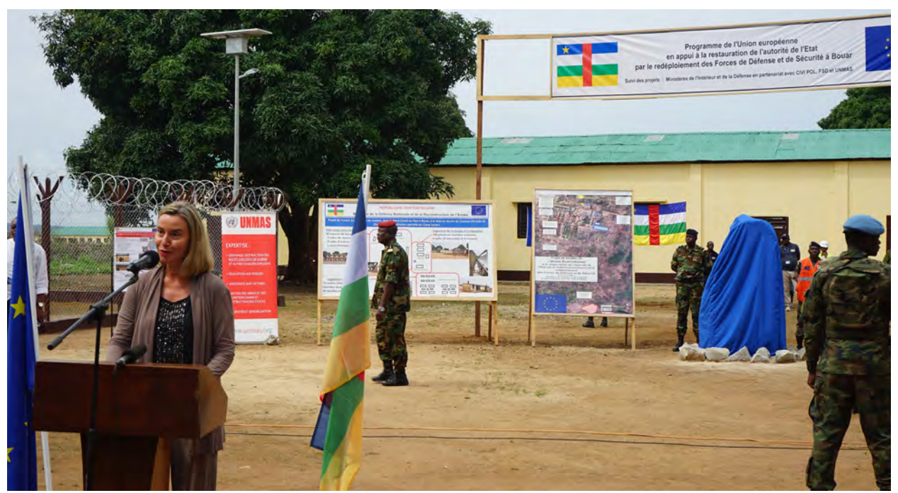
Federica Mogherini, European Union High Representative for Foreign Affairs and Security Policy, launches a European Union-funded mine action project in Bouar, Central African Republic – to construct and hand over specialized WAM infrastructure to national authorities.

The shift from predictable, sustainable, flexible and multiyear funding to earmarked contributions continues to impact the ability of UNMAS to deliver on all aspects of its mandate, respond to requests from Member States and United Nations senior management and backstop its programmes at Headquarters.