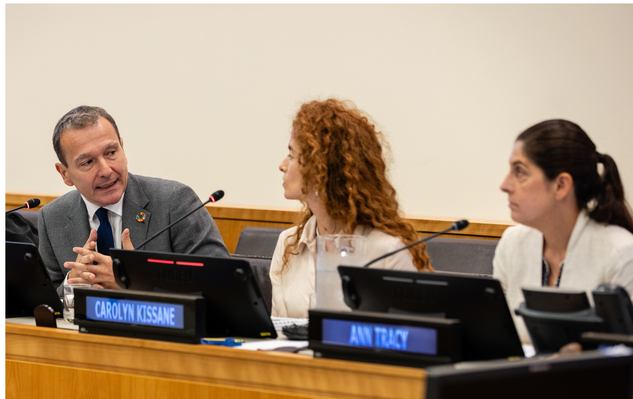
Participants discussing just transition to net zero and a nature positive world at the SDG Global Business Forum in July 2023

UN DESA ensured universal access to up-to-date data critical for monitoring SDG progress. Through the improved Global SDG Indicators Data Platform, the Department developed a new interface that allows users to easily search, download and share data. The entirely new 'SDG Analytics' tool allows the interactive analysis of data availability, including for disaggregated data. The SDG Analytics tool also enables users to review global and regional trends for individual indicators and compare trends for countries and areas and for different indicators. The platform also provides access to the SDG Country Profiles which—with a single click—provide trends for individual countries across the