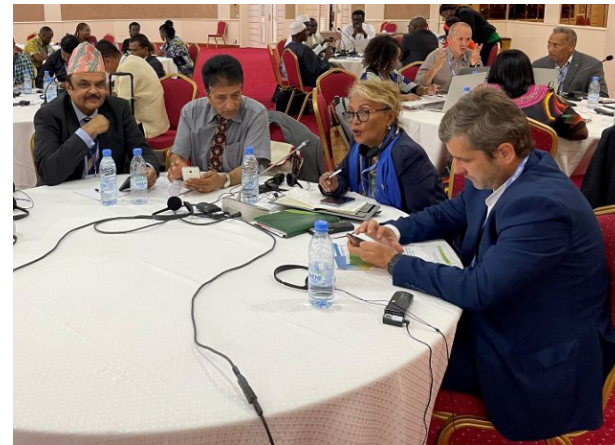
Participants discuss at the International Mayors Forum in April 2023 in Dakar, Senegal

In collaboration with the Asia-Europe Foundation, UN DESA also convened the 2022 Sustainable Development Transformation Forum (SDTF) to