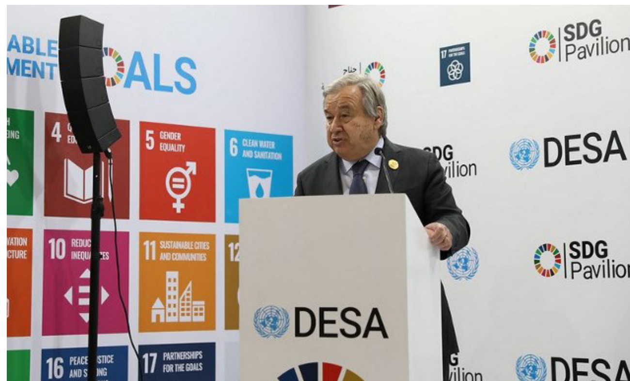
UN Secretary-General António Guterres speaks at the SDG Pavilion at COP27 in Sharm El-Sheikh, Egypt.

Looking ahead, UN DESA will continue to advance this integrated agenda in key forums, including the SDG Summit, the UNFCCC Regional Climate Weeks and COP28 in Dubai, to drive action and collaboration towards achieving the SDGs and addressing climate-related challenges.