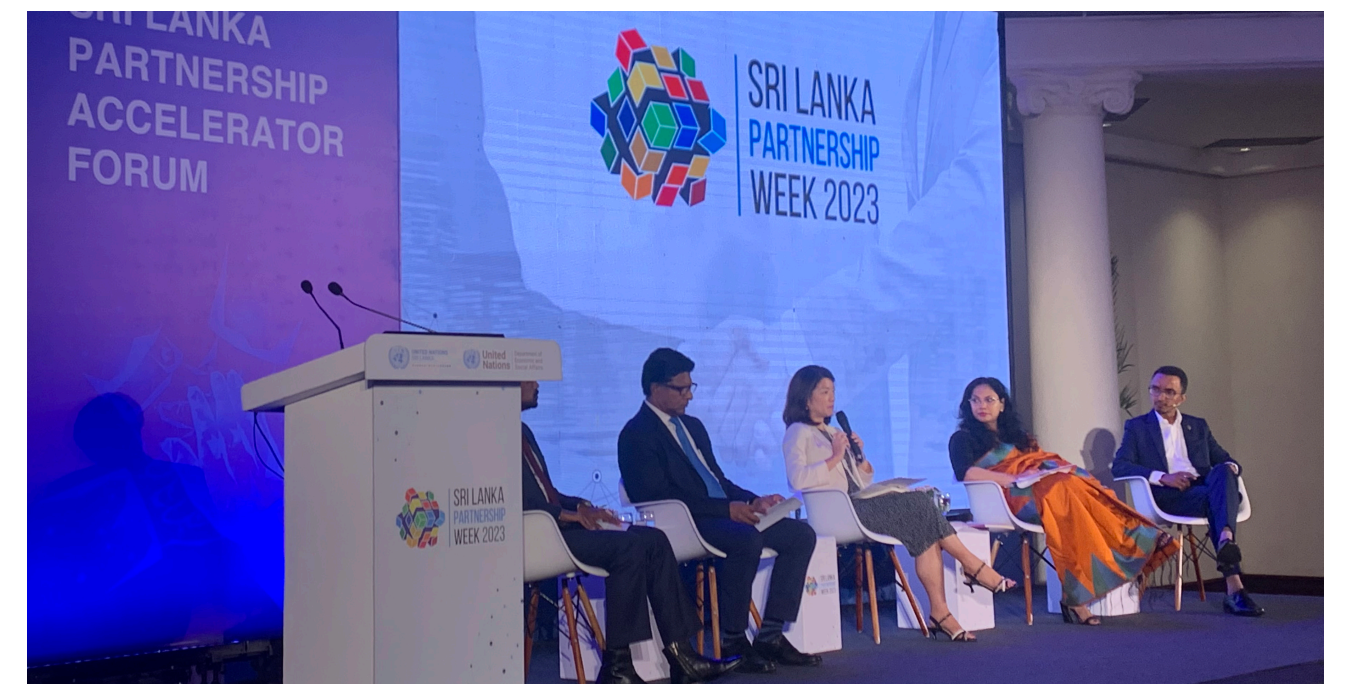
Collaboration and Innovation took center stage at the Sri Lanka Partnership Week 2023