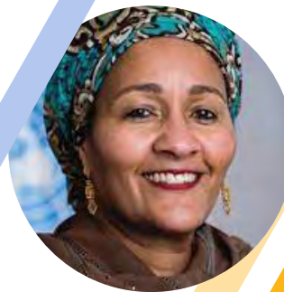
AMINA MOHAMMED UN Deputy Secretary-General