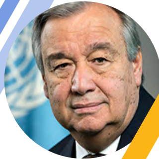
ANTÓNIO GUTERRES UN Secretary-General

UN Deputy Secretary-General Amina Mohammed noted, "Success is going to depend on how we tackle two key challenges. First, the 760 million people around the world who do not have access to electricity, and the 2.6 billion people that lack access to clean cooking solutions. Second, without decarbonization of our energy systems, we will not reach the 1.5 degree goal of the Paris Agreement."