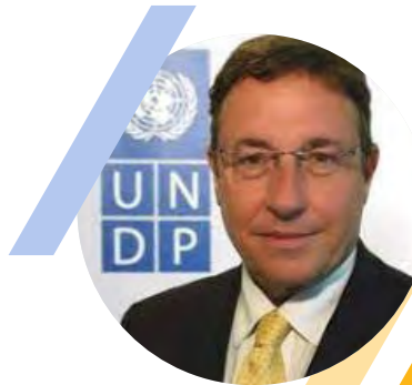
ACHIM STEINER Administrator for UNDP and Co-Chair of UN-Energy