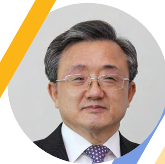
LIU ZHENMIN Under-Secretary-General for the United Nations Department of Economic and Social Affairs and HLDE Secretary-General

HLDE Secretary-General Liu Zhenmin said, "The Dialogue is not just a conference, it is the start of a new phase. UN-Energy will continue to support mobilization of more Energy Compacts in the years to come."