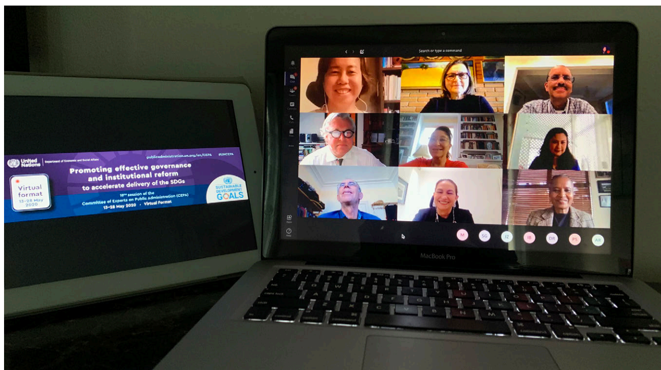
Participants in the 19th Session of the Committee of Experts on Public Administration

UN DESA is working to strengthen the capacities of public institutions and public servants to deliver good quality public services to everyone. Never has the need for effective and accountable institutions, inclusive public service delivery and the critical role of public servants been more evident than during the COVID-19 pandemic.