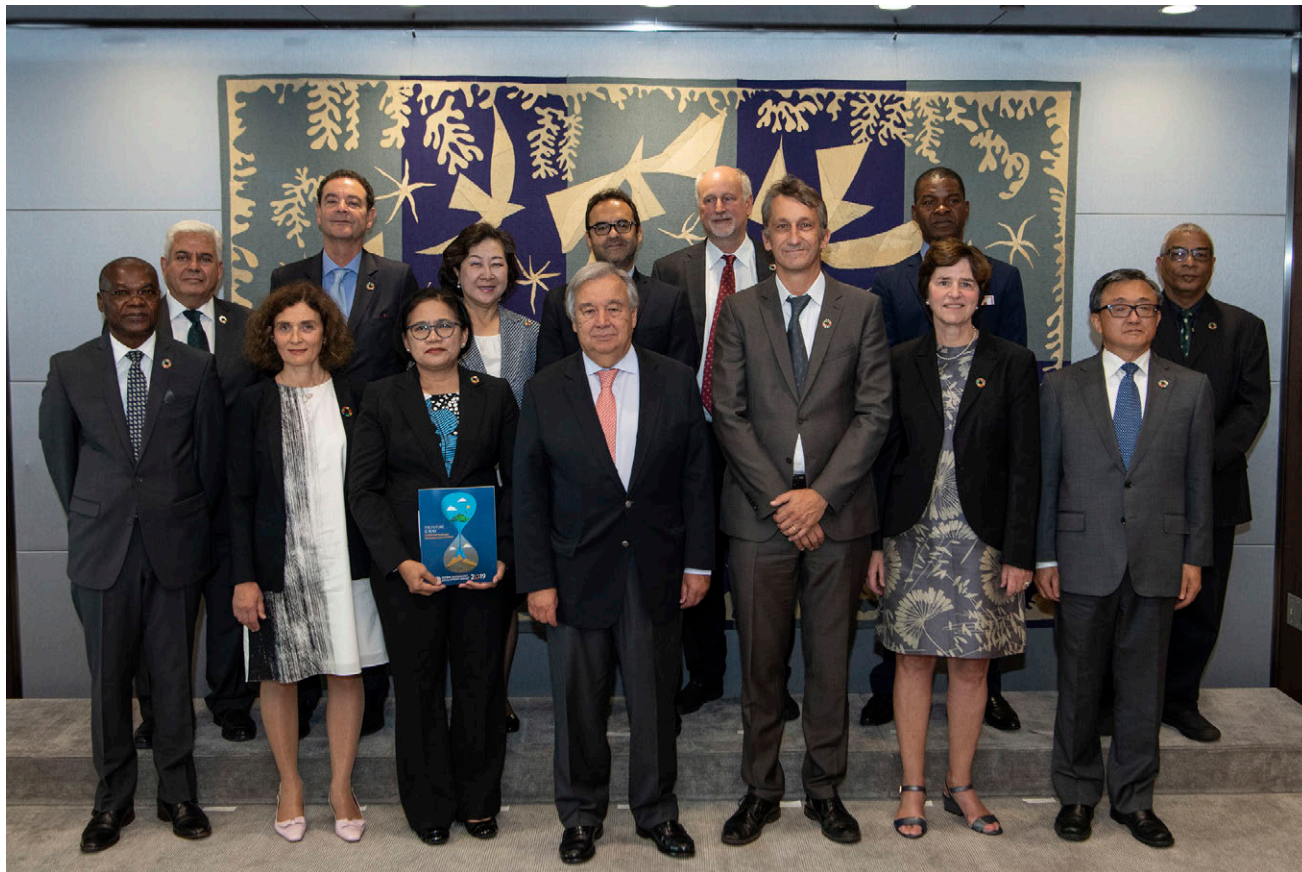
A panel of independent scientists authored the GSDR, with support from a UN DESA-led UN-System Task Team.

UN DESA has continued to support the important work of the ECOSOC High-level Segment, in its focus on future trends and scenarios. To support the discussions in the 2020 Segment UN DESA prepared a report on Accelerated action and transformative pathways: realizing the decade of action and delivery for sustainable development. UN DESA's report on Long-term future trends and scenarios-impacts in the economic, social and environmental