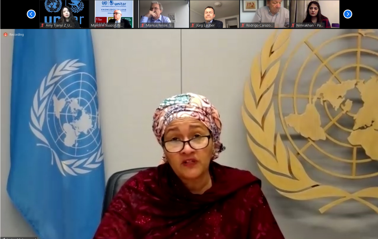
Capture of QCPR UNITAR Training Session in 2020 – Photo Credit: UN DESA

UN DESA identified the Common Country Assessments