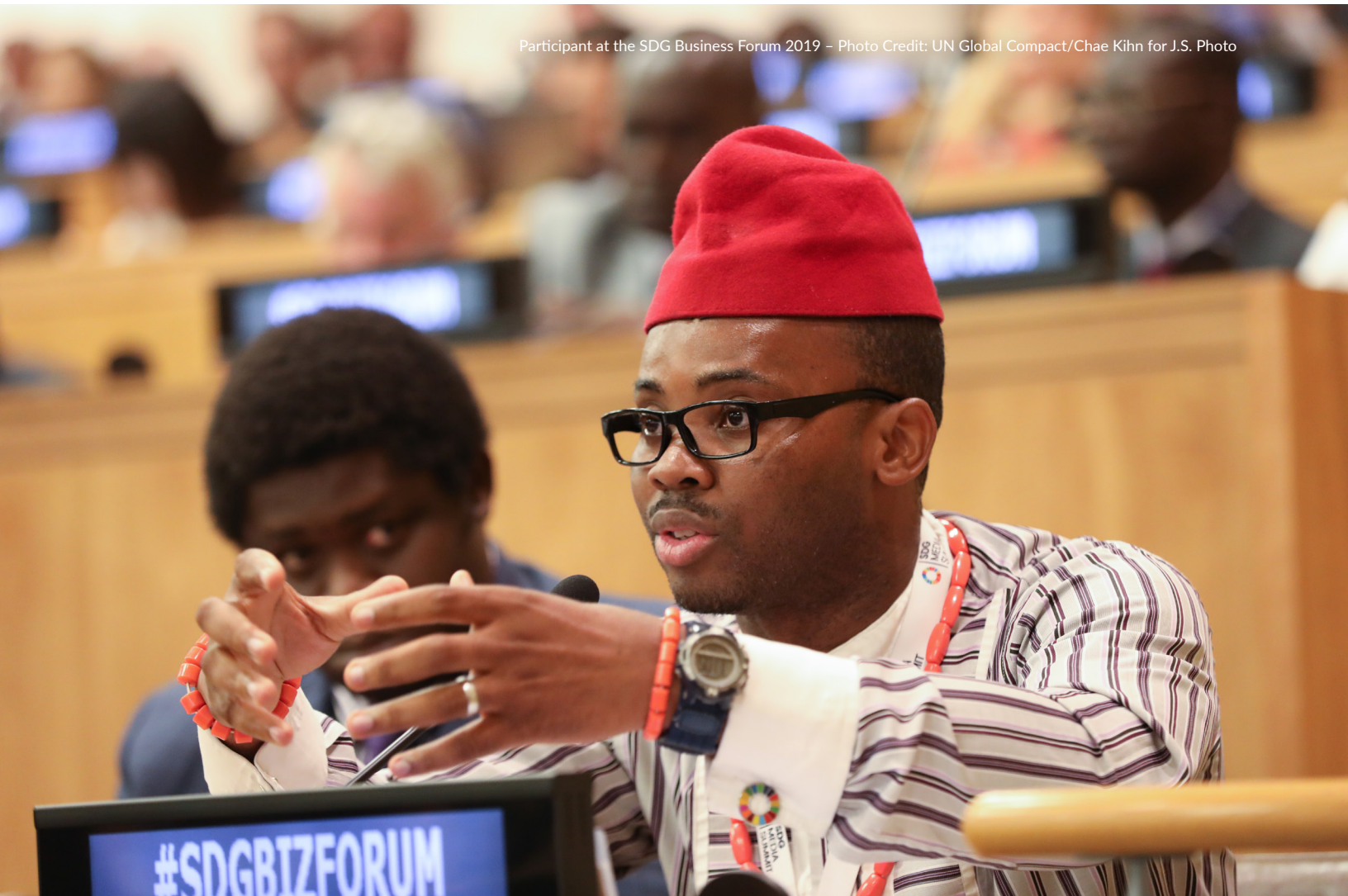
Participant at the SDG Business Forum 2019