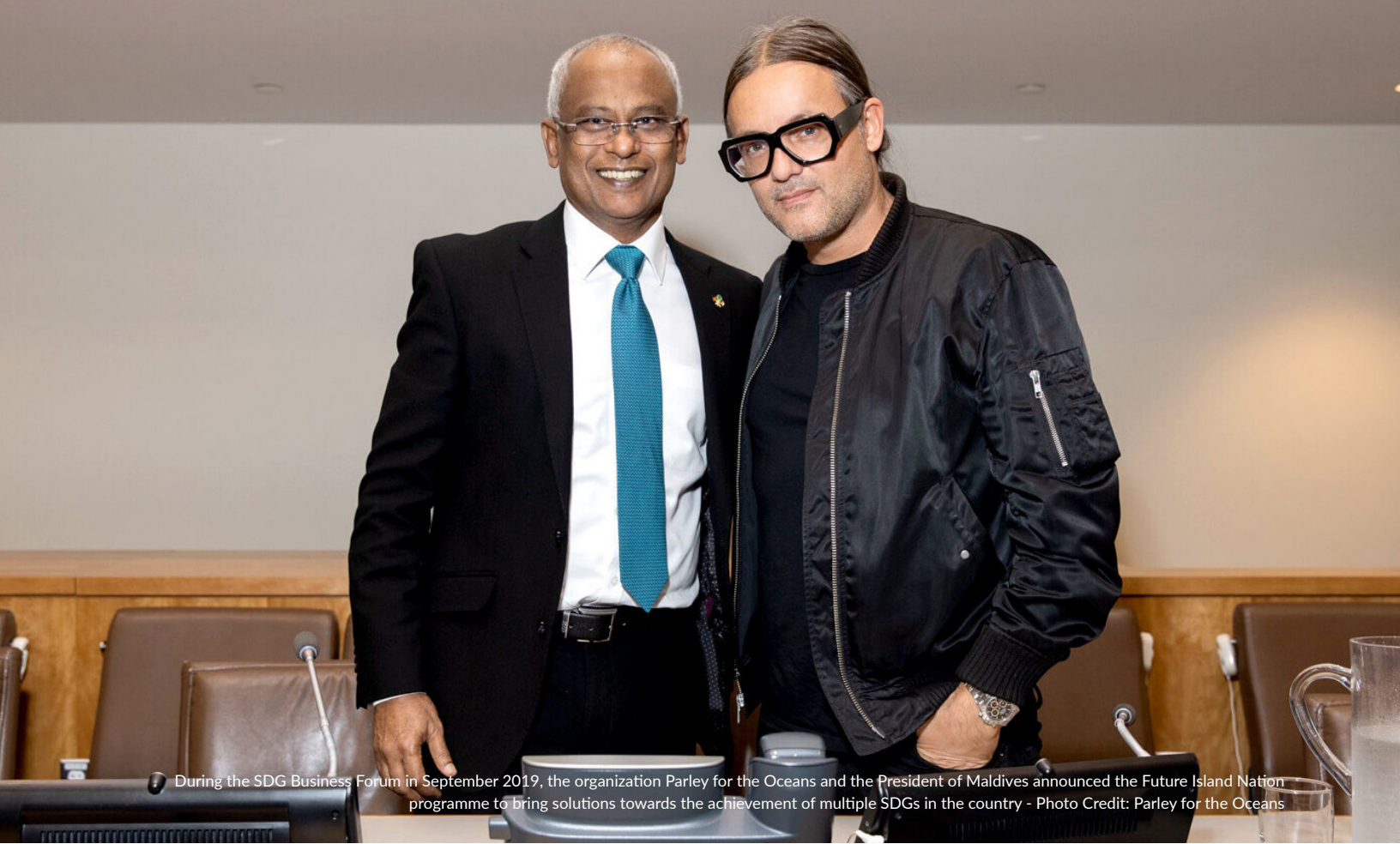
During the SDG Business Forum in September 2019, the organization Parley for the Oceans and the President of Maldives announced the Future Island Nation programme to bring solutions towards the achievement of multiple SDGs in the country