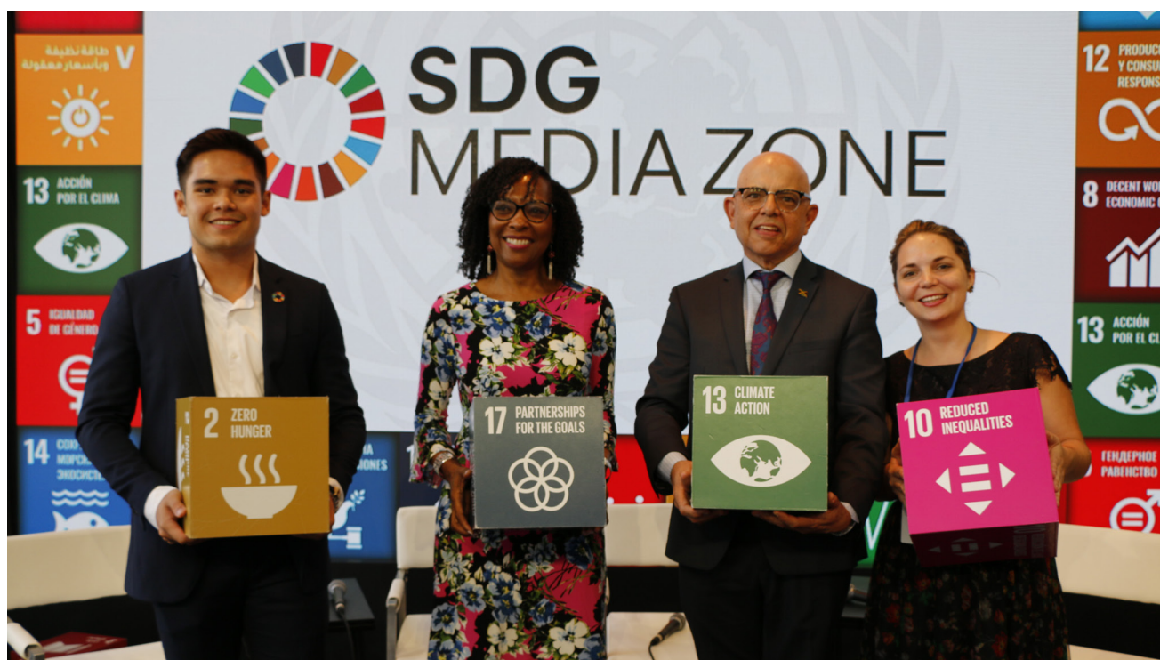
Representatives of the Caribbean Philanthropic Alliance, a regional partnership for SDG implementation, announce their initiative in the SDG Media Zone on the margin of the UN General Assembly on 27 September 2019.

The achievement of the 2030 Agenda will require an unprecedented level of cooperation and collaboration among all levels of government, civil society, businesses, foundations, academia, and others, and finding new ways of working. Through its normative, analytical and capacity-building work, UN DESA continues to engage diverse stakeholders at all levels around the follow-up and implementation of the 2030 Agenda and to provide platforms – both in person and virtual – to discuss and foster multi-stakeholder partnerships in support of the SDGs.