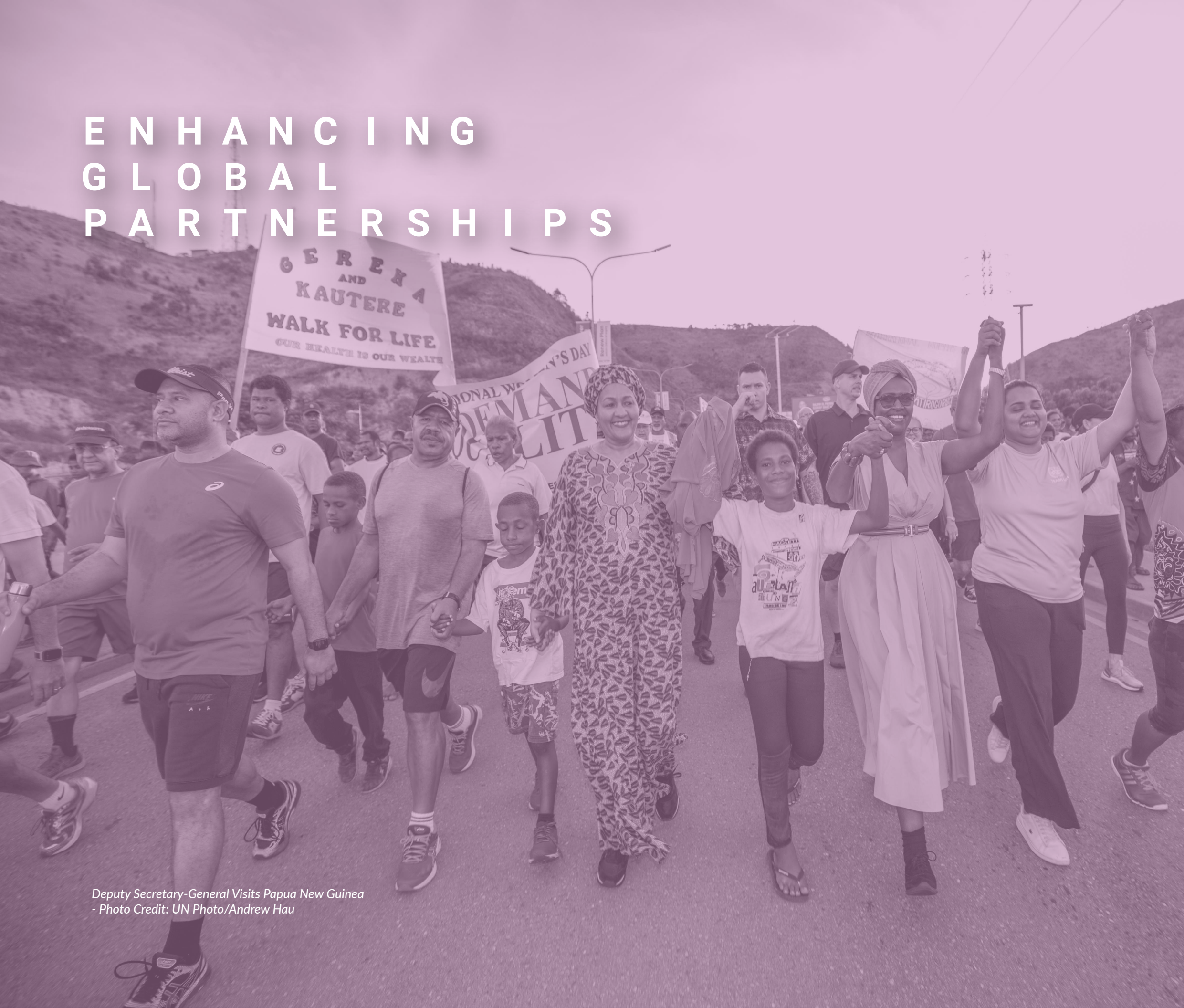
Deputy Secretary-General Visits Papua New Guinea

Partnerships are critical to making the 2030 Agenda and the SDGs a reality. In 2019-2020, UN DESA continued to support the engagement of different stakeholders in the implementation and follow-up of the 2030 Agenda and to foster multi-stakeholder partnerships.