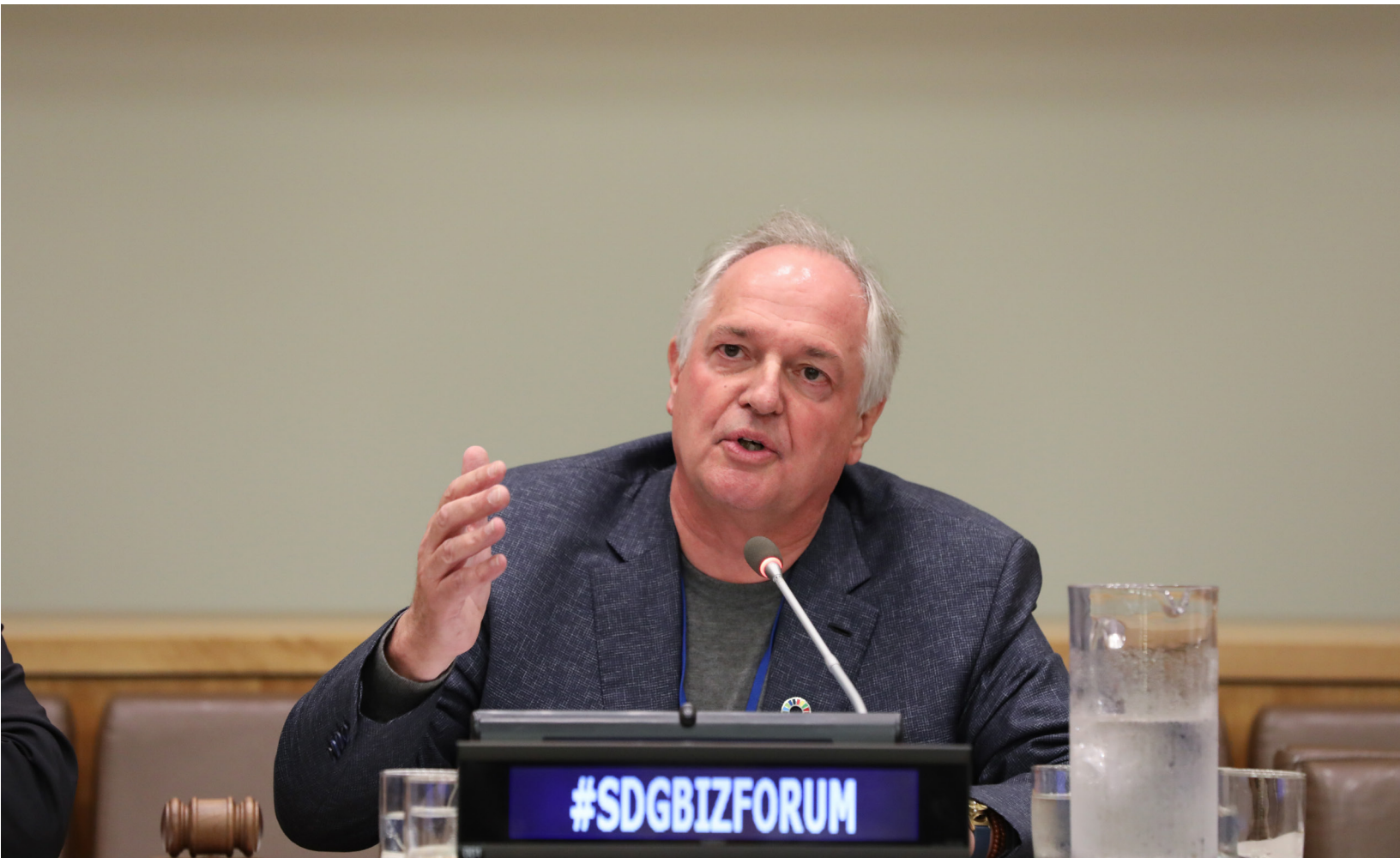
SDG Advocate Paul Polman, Chair of the International Chamber of Commerce, the B Team and Vice-Chair of the UN Global Compact, delivers a passionate speech about the need for businesses to deliver the promises of the SDGs, at the SDG Business Forum on 25 September 2019.