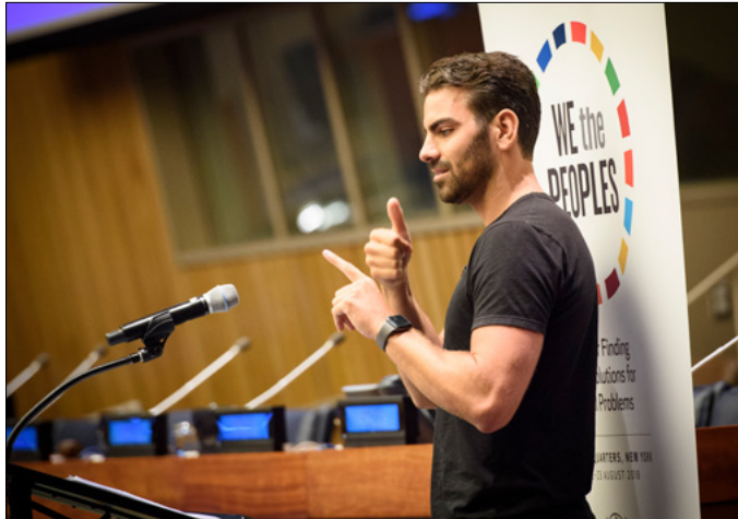
Mr. Nyle DiMarco, Model, Actor and Deaf Activist, addresses the participants at the Opening Plenary Session.

education system. He emphasized the importance of validating the needs and experiences of people with disabilities and empowering them to shape their societies. He argued that limited access to education leads to limited access to employment, resulting in social exclusion. Young people who are facing exclusion lack a means for employment opportunities. Therefore, he said, our duty as global citizens is to consider the needs of those with disabilities. In conclusion, he condemned the marginalization of people with disabilities and urged greater inclusion.