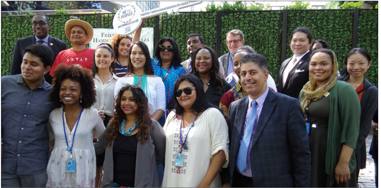
Participants at the Social Media Hangout promoting the 67th UN DPI/NGO Conference.