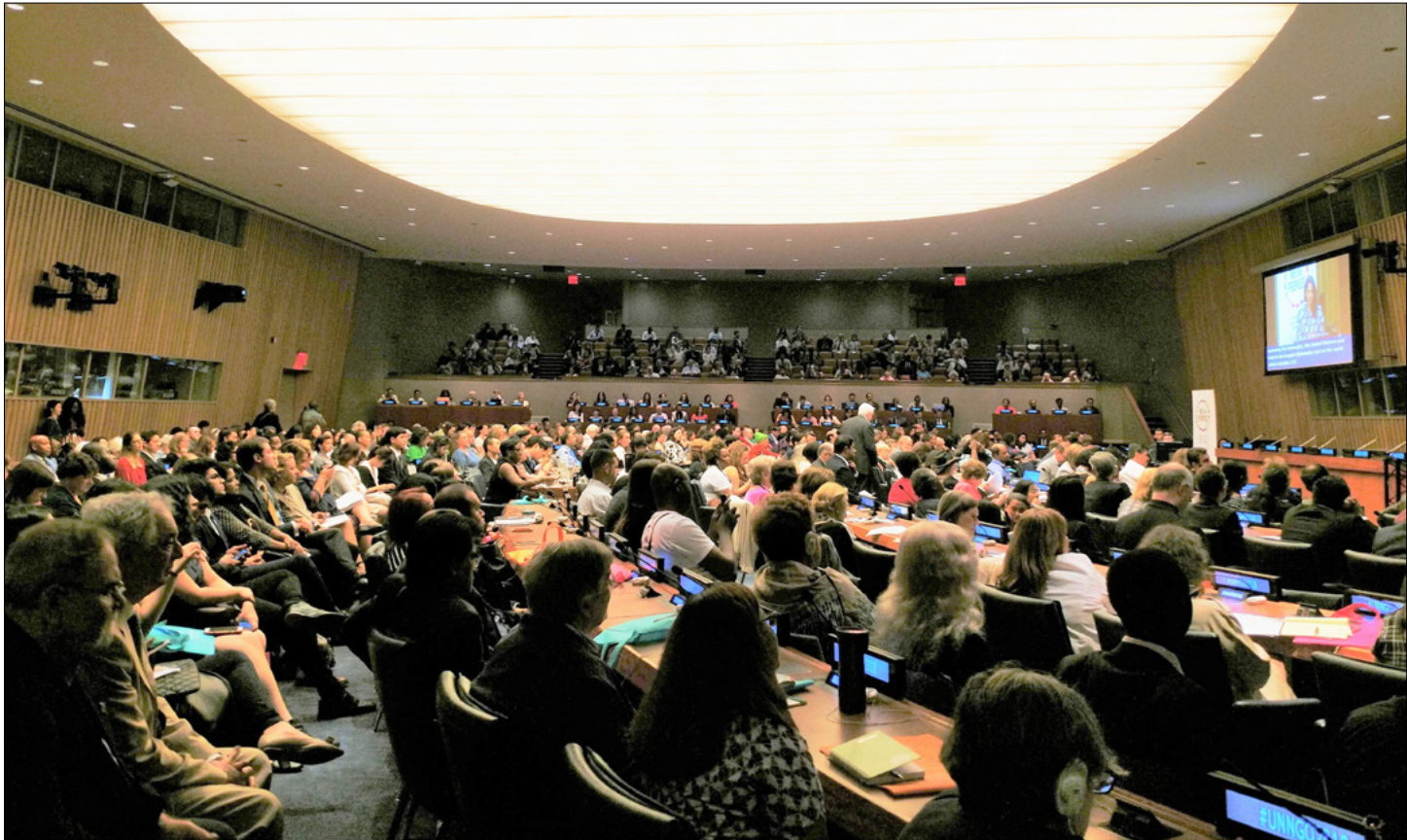
View of Conference Room 4 during the Opening Plenary Session of the 67th UN DPI/NGO Conference.

by the voices of ordinary people. This work, she stated, means that NGOs must push against governments and other powers, when necessary, and refuse to be relegated to the role of cheerleaders of government. While acknowledging that NGOs focus on different problems, she also noted that there are many challenges they share, including increasingly extreme politics and governments' attempts to limit the voice of the people. She paid tribute to the late Kofi Annan and the humility and humanity of his leadership style. Finally, she emphasized the importance of NGOs pushing for justice and peace.