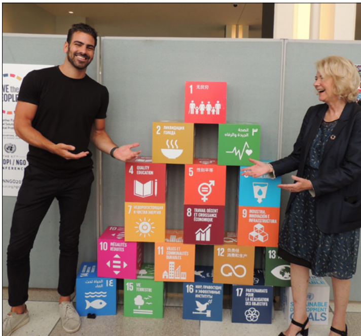
Nyle DiMarco, American Model, Actor and Deaf Activist and Alison Smale, Under-Secretary-General for Global Communications at the Conference Youth Hub promoting youth involvement with the UN Sustainable Development Goals (SDGs).