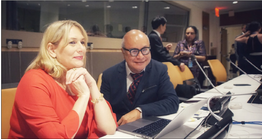
Attendees following the conclusion of the “Achieving Global Access to Healthcare Treatments: the Role of New Technology, Traditional and INtegrative Medicine” workshop.