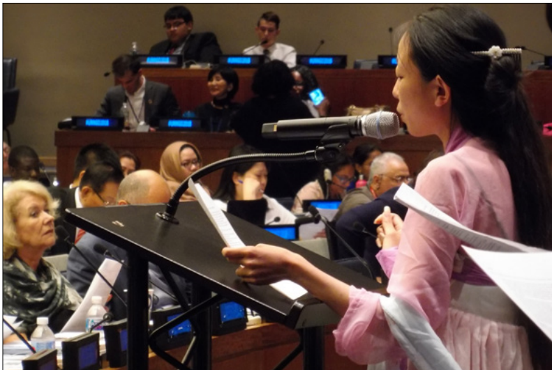
Participants of the Youth Hub session during the 67th UN DPI/NGO Conference.