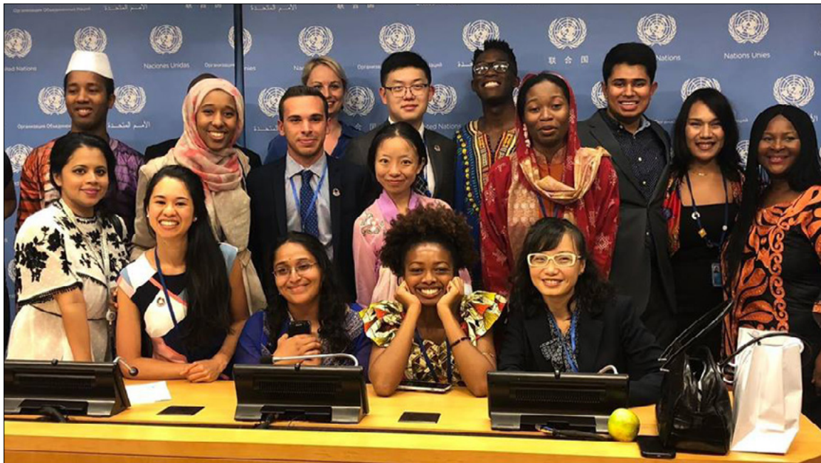
Youth Participants and Members of the NGO Youth Steering Committee following the press conference at the end of the 67th UN DPI/NGO Conference.

Over one-third of participants at the 67th UN DPI/NGO Conference were youth and young people played a leadership role in planning this conference as well as molding