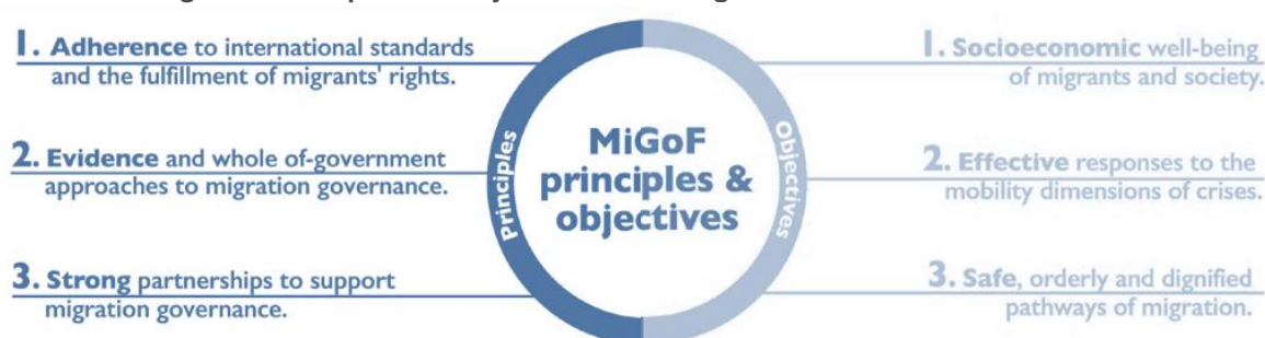
Figure 1. Principles and objectives of the Migration Governance Framework

The three principles propose the necessary conditions for migration to be well-managed by creating a more effective environment for maximized results for migration to be beneficial to all. These represent the means through which a State can ensure that the systemic requirements for good migration governance are in place.