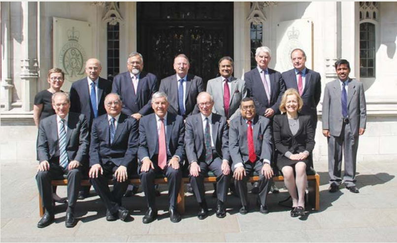
Right: Members of the UK and Indian delegations during the Indo-British Legal Forum, June 2012.