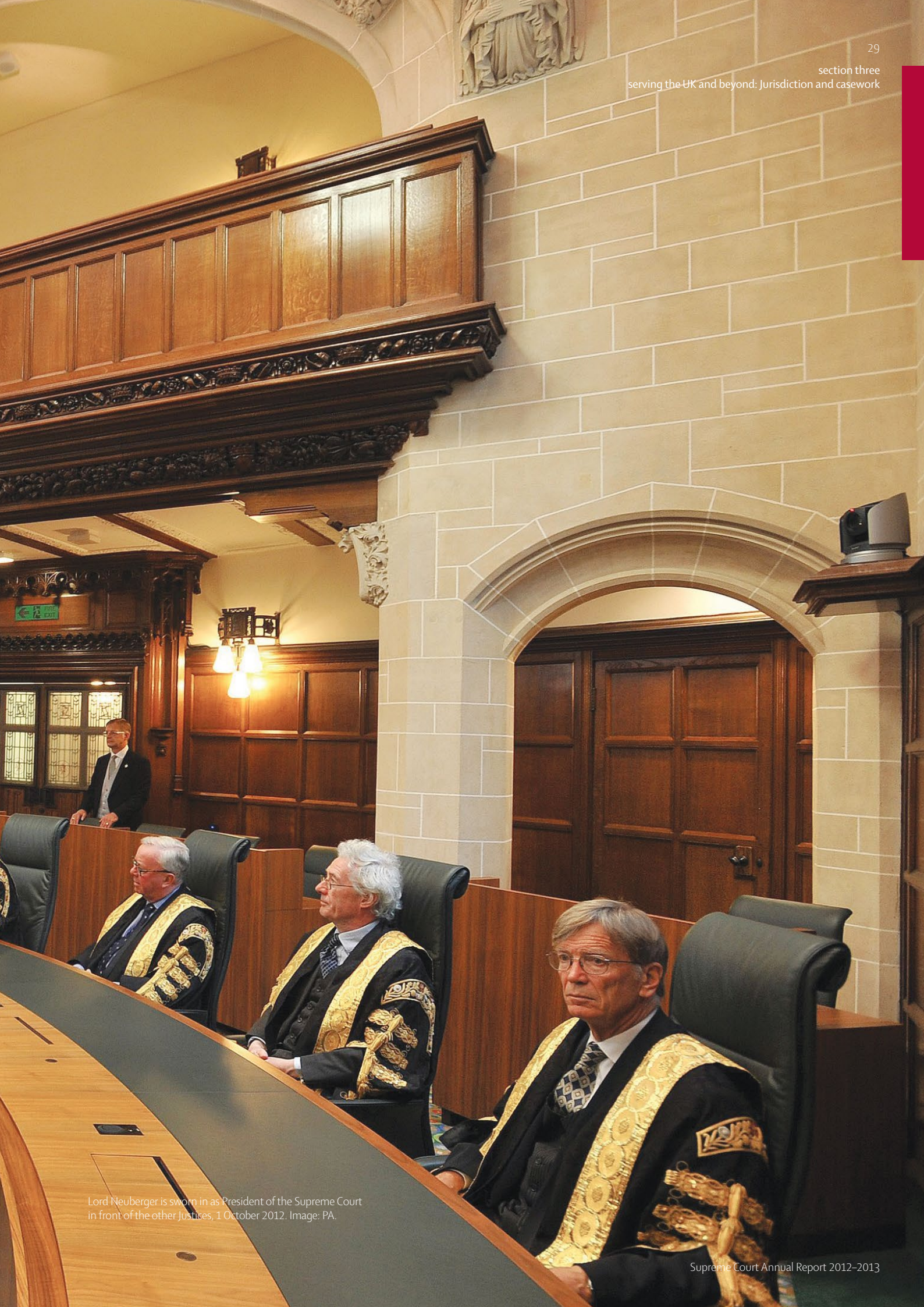
Lord Neuberger is sworn in as President of the Supreme Court in front of the other Justices, 1 October 2012.