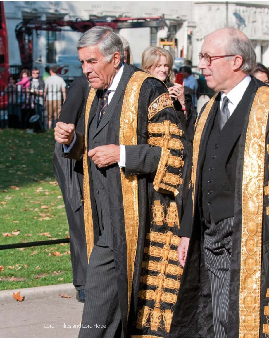
Lord Phillips and Lord Hope