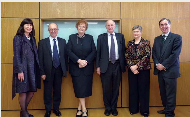
Top: Members of the Northern Ireland Assembly Justice Committee shown with Lord Hope and Lord Kerr in Court 2 during their visit in March 2013.