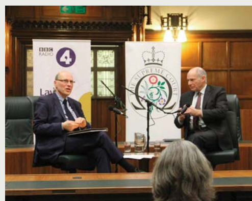
Top right: Joshua Rozenberg (left) interviews Lord Neuberger for BBC Radio 4's 'Law in Action' programme, March 2013.