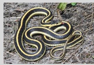
Common Garter snake