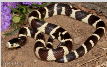
California King snake