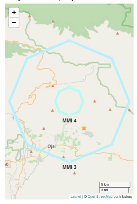
Figure 2. Polygons show shaking intensity contours for the peak magnitude estimate. Shaking of MMI 3 or less is often not felt. Star shows the ANSS earthquake epicenter.