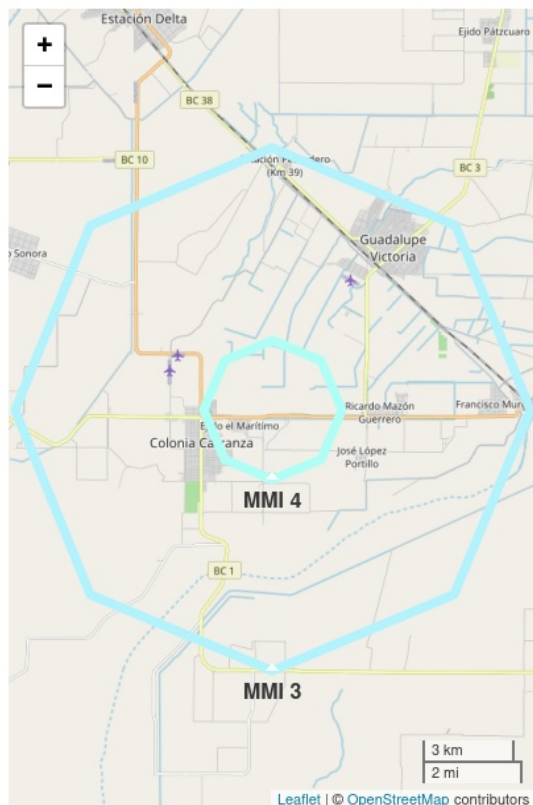
Figure 2. Polygons show shaking intensity contours for the peak magnitude estimate. Shaking of MMI 3 or less is often not felt. Star shows the ANSS earthquake epicenter.

Report created 2024-05-12 17:06:21 (Pacific)