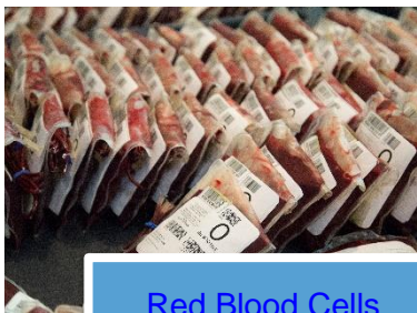
Red Blood Cells