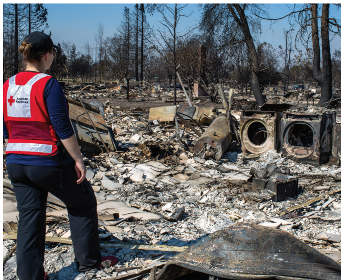
A Red Cross volunteer assesses damage from the Tubbs Fire in Santa Rosa, California.

Thousands of Red Cross volunteers helped shelter displaced families and visited fire-scorched neighborhoods with food and cleanup supplies. Red Cross recovery teams provide financial support to families and coordinated with partners to provide needed community services.