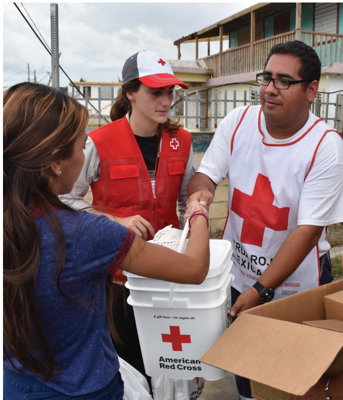
Red Cross workers distribute relief supplies to Hurricane Maria survivors in Barceloneta, Puerto Rico.

During recovery, the Red Cross is partnering with the Commonwealth to strengthen individual and community resilience by installing solar micro-grids, water purification systems and AED devices in more than 100 schools that are also used as shelters—in addition to providing financial grants to small business farmers and connecting solar power to community-owned wells. To assist children and families, the Red Cross is providing wellness checks and vaccinations, as well as supporting after school and summer school programs.