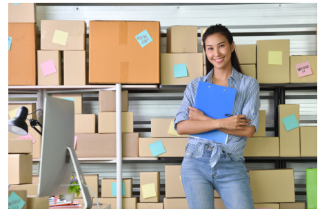
Once authenticated, the merchant receives a chargeback liability shift