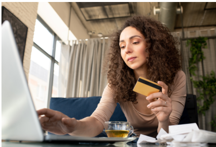
Meta data provided by the card issuer is used to authenticate card holders

PAAY's EMV®3DS solution gives business owners choice, and control of their destiny. By authenticating cardholders at the point of interaction on the web, PAAY shifts the chargeback liability off the nutraceutical giant, and onto the card issuer.