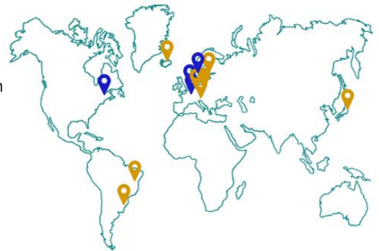
Pilot cities and regions