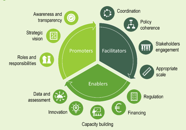
Figure 4. The 12 governance dimensions of the OECD Checklist for Action

The Checklist is accompanied by the OECD Scoreboard on the Governance of the Circular Economy in Cities and Regions, a self-assessment tool for governments aiming to assess the advancement towards the implementation of each of the 12 governance dimensions. The potential scores that may be given for each governance dimension range from 1 to 6 or not applicable, corresponding respectively to: (1) Planned; (2) In development; (3) In place, not implemented; (4) In place, partly implemented; (5) In place, functioning; and (6) In place, objectives achieved.