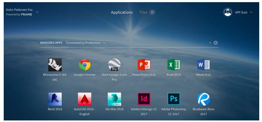
Design Applications Available in a Browser on any Devicem