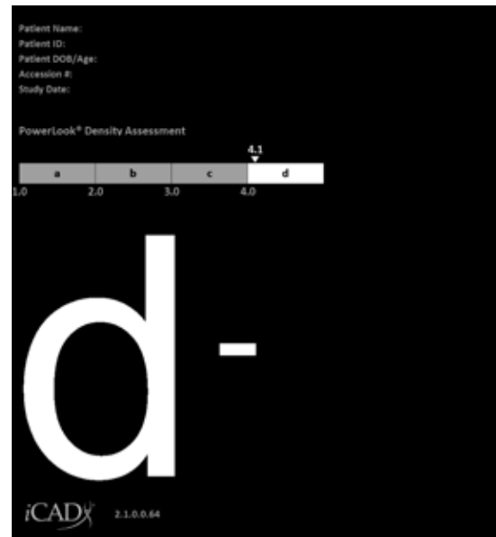
Clinical Support Decision Scorecard