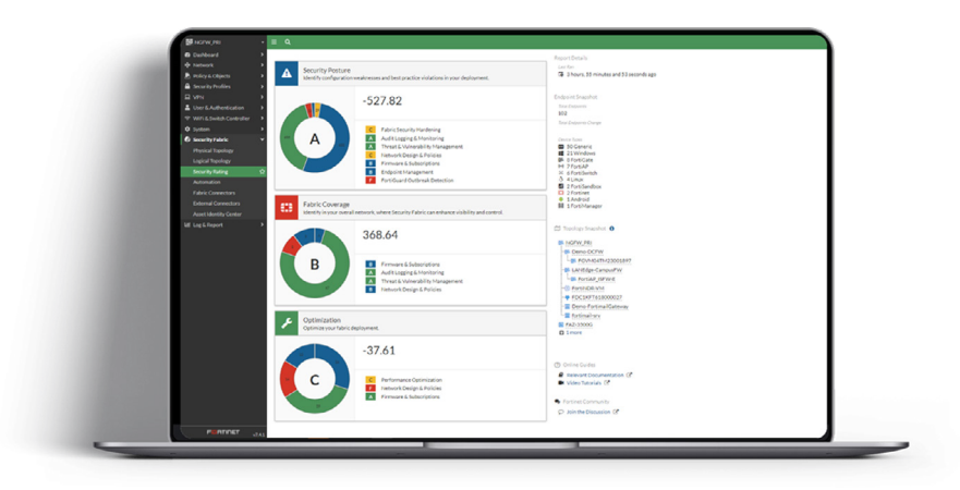
Figure 2: FortiGuard Attack Surface Security Service

Because SMBs often face tough challenges in hiring and retaining security personnel, it can be especially hard to remain more proactive. This is where attack surface management can be especially beneficial for them.