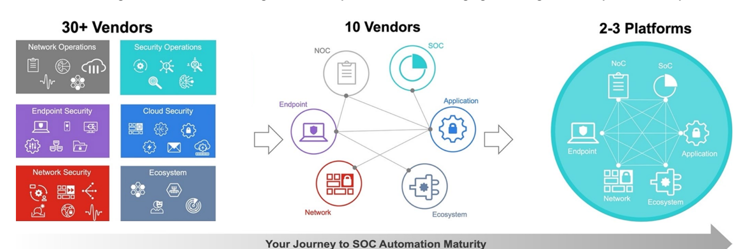
Figure 1: Vendor consolidation enables efficient, synchronized, and automated operations.

Data overload: High volumes of network logs and security data can be challenging to manage and analyze effectively.