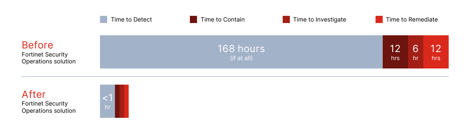
Figure 3: Quatified Benefits of the Implementing Fortinet Security Operations components