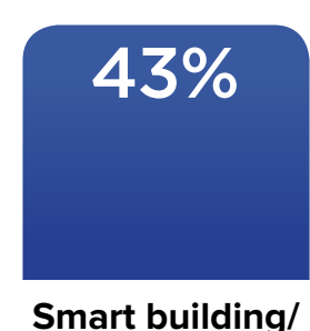
building management solutions