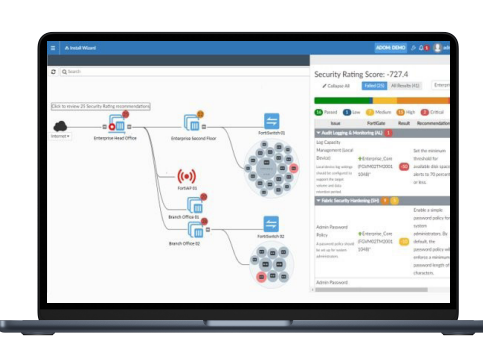
Intuitive view and clear insights into network security posture with FortiManager