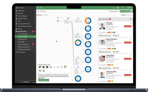
Intuitive easy to use view into the network and endpoint vulnerabilities