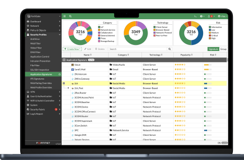
Visibility with FOS Application Signatures