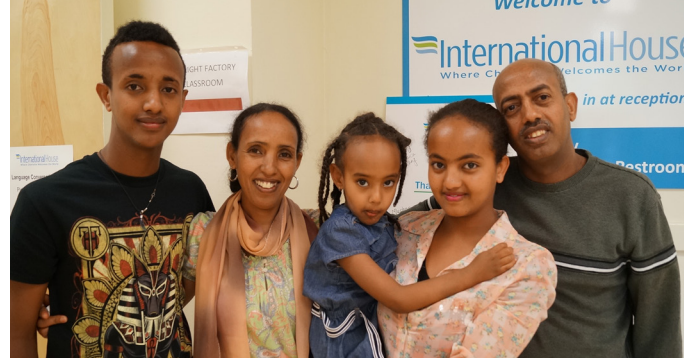
A family who fled their native country as refugees was reunited thanks to legal assistance provided by The Ginter Immigration Law Clinic at International House in Charlotte.