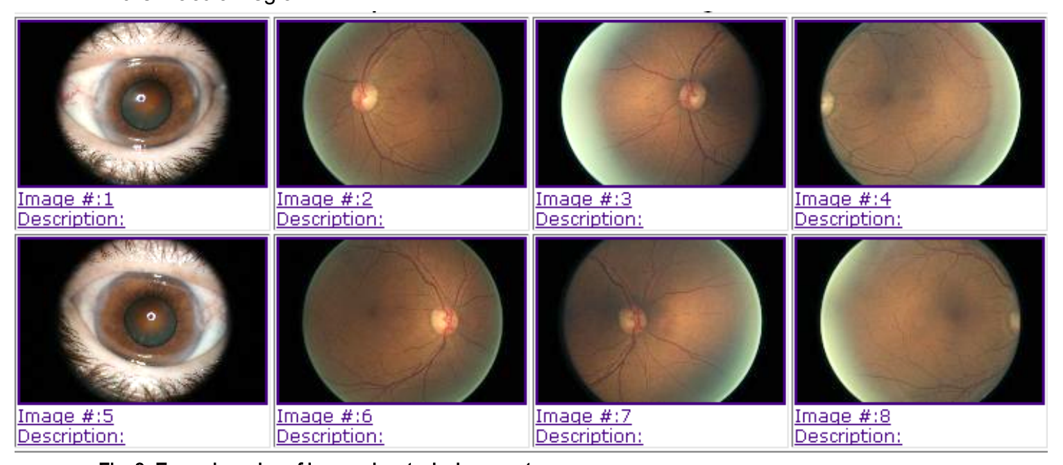
Fig. 3. Example series of images in a typical encounter.

Readers use the following conventions in evaluating the presence and severity of retinal abnormalities: