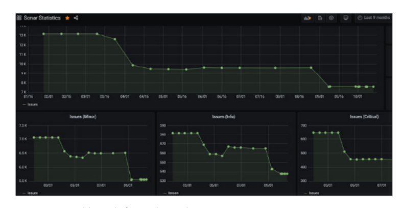
Figure 2: Dashboards for Code analysis