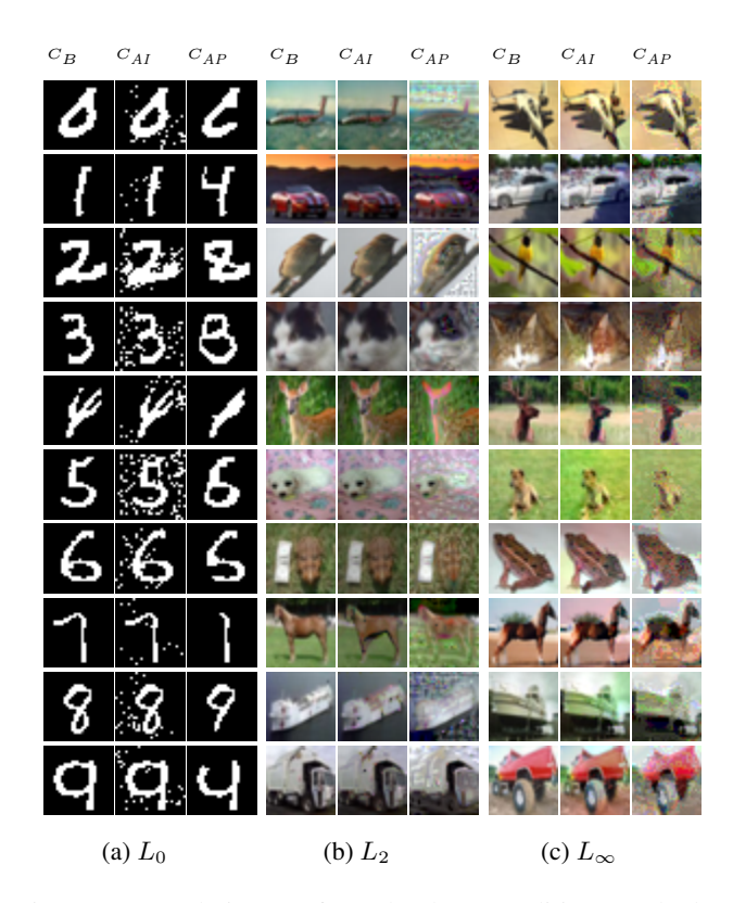
Figure 2: Sample images from the three conditions we had for each L_p -norm. Each row shows three variants of the same image.

Study Details. We used the MNIST dataset and DNN to test whether it is possible to perturb images only slightly on L_0 while simultaneously misleading humans and DNNs. C_B was assigned 75 randomly selected images from the test set of MNIST. All 75 images were correctly classified by the DNN. We used the Jacobian Saliency Map Approach