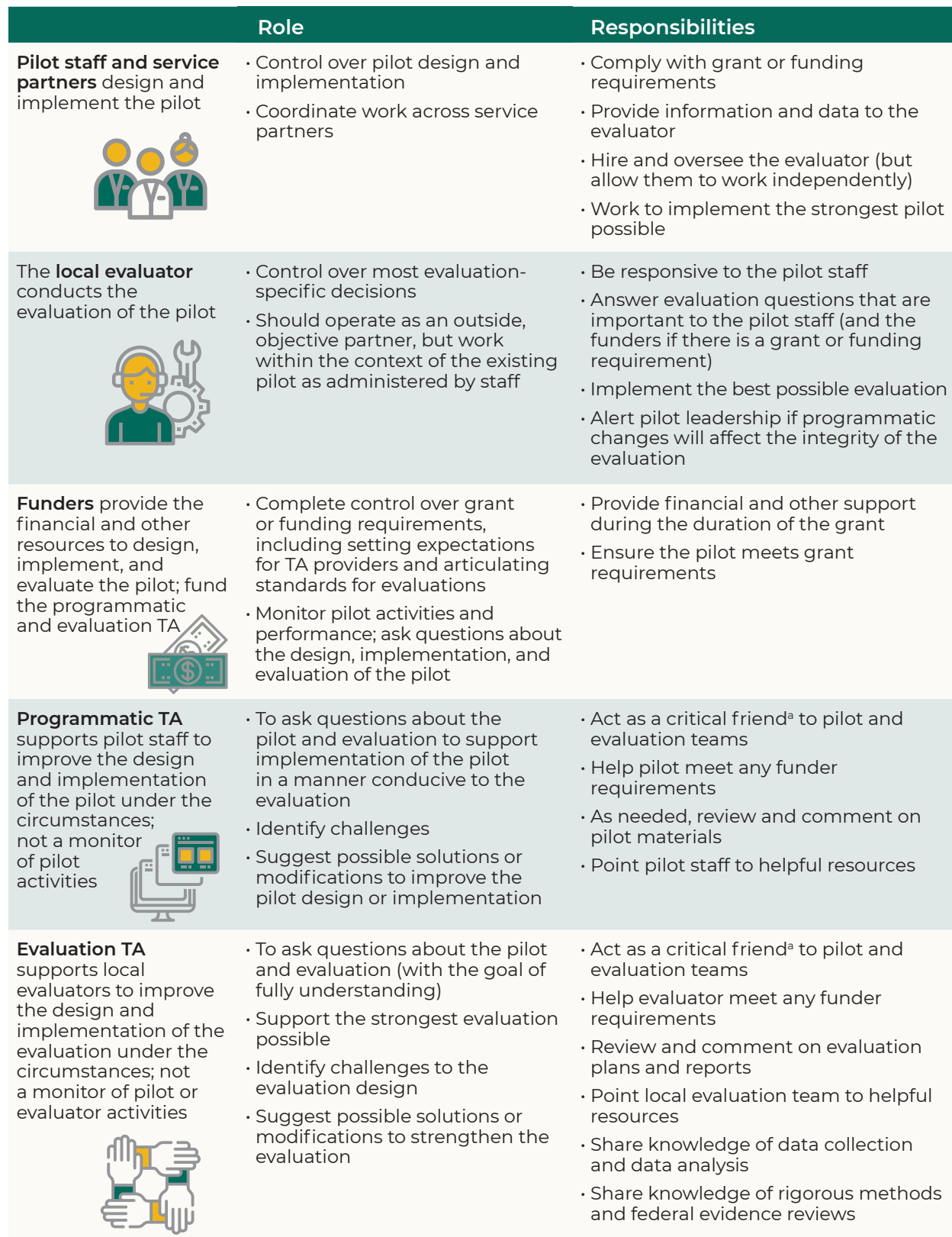
Table 1. The roles and responsibilities of the P3 partners