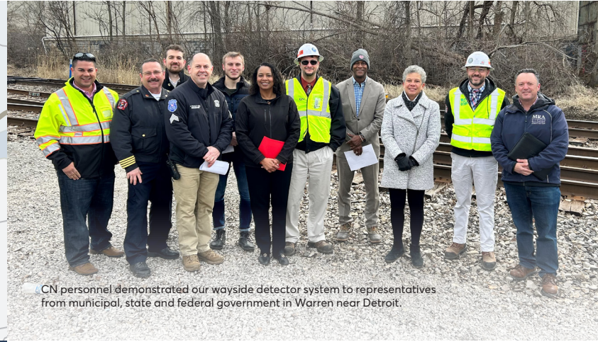
CN personnel demonstrated our wayside detector system to representatives from municipal, state and federal government in Warren near Detroit.