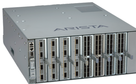
Arista 7358X4: 128 ports of 25G or 100G, or 32 ports of 400G

All elements of the 7358X4 are field replaceable, and optimized for simple maintenance, a broad range of network interfaces with a choice of industry standard interfaces allowing for easy transitions to the latest 100G/400G networks. Combined with Arista EOS the 7358X4 series deliver advanced features for high performance enterprise data centers, HPC and machine learning clusters.