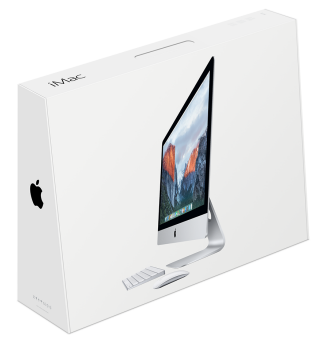
The 21.5-inch iMac retail packaging consumes 53 percent less volume and weighs 35 percent less than the original 15-inch iMac packaging.