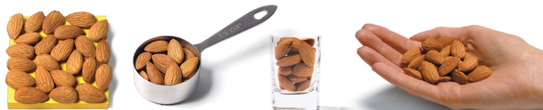
3" x 3" STICKY NOTE

Here are some ways to measure the perfect portion every time: