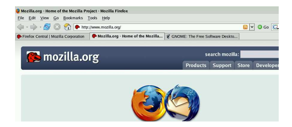
Fig. 1: Tabbed Browsing in Firefox

Firefox has been highly successful, earning praise for its innovative features as well as robustness [10, 22].