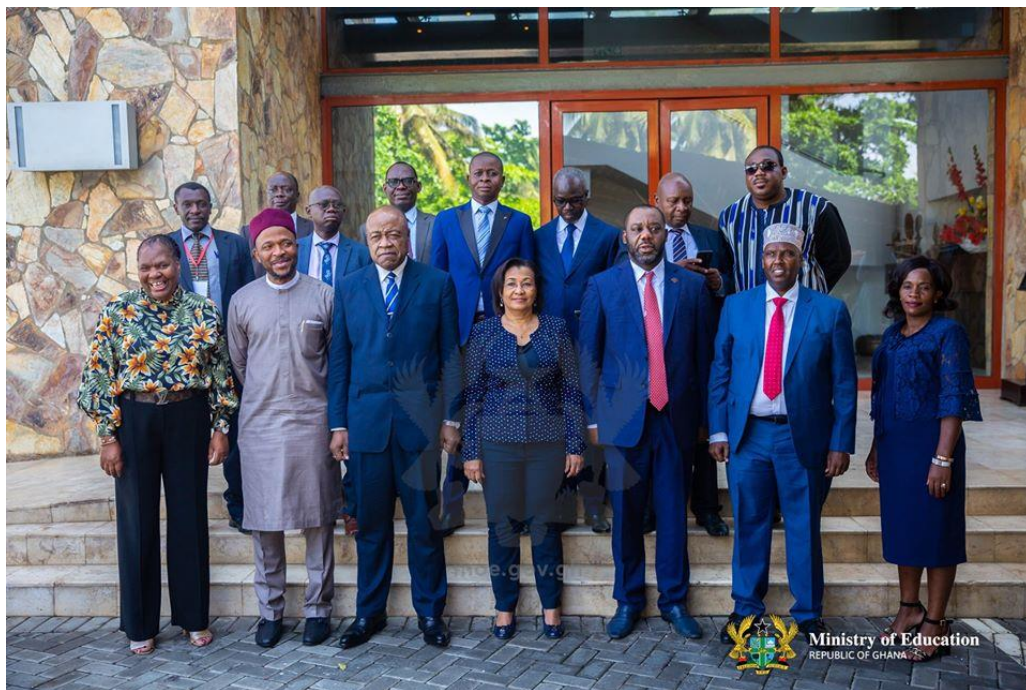
Ministers of State in Charge of Libraries in a Picture

In his welcome address, the Chairman iterated the purpose of the meeting which is related to the two existing Documents (Cape Town Declaration and Durban Communiqué). He stated that the development of Africa depends on effective access to information which does not just happen but requires proper planning, availability of funds, good equipment coupled with the skills of information custodians (Librarians).