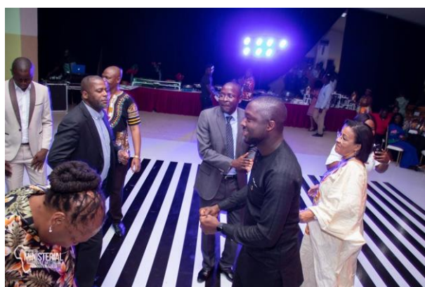
Ministers showing their dancing skills having fun