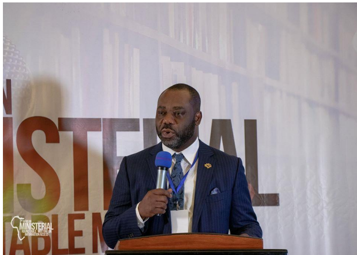
Ghana's Hon. Minister of Education- Dr. Matthew Opoku Prempeh delivering his Welcome Address

AfLIA in conjunction with the Ministry of Education, Ghana, Ghana Library Authority and the African Union, hosted the 3rd Roundtable Meeting of Ministers in charge of Public Libraries in Africa at Labadi Beach Hotel, Accra-Ghana from 28-30th October, 2019. The theme for the Summit was Libraries on the African Development Agenda- Progress Made . The purpose of the summit was to discuss the progress made by Libraries towards achieving the African Development Agenda. It was also to emphasize the fact that access to information is crucial for development in Africa, and to reiterate that Libraries are best suited to perform that role. The occasion was graced with about twenty-five (25) representatives from different African countries, Fourteen (14) of them as Ministers responsible for Libraries in their countries. (Angola, Burkina Faso, Cameroon, Central African Republic, Ghana, Guinea Bissau, Kenya, Lesotho, Malawi, Nigeria, Senegal, South Africa, Uganda and Zimbabwe).