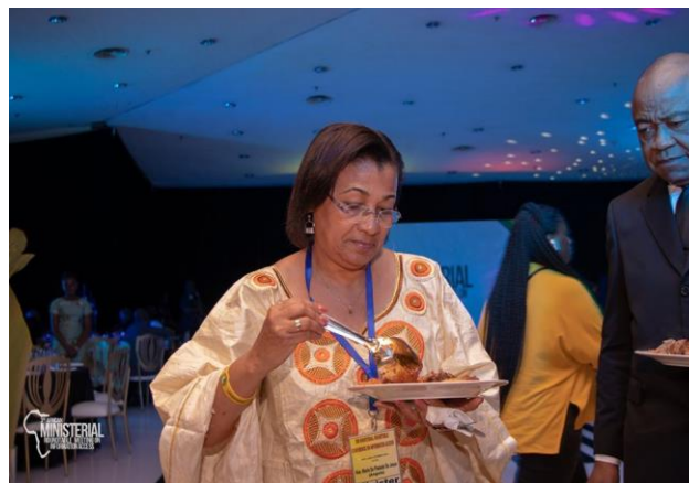
Ministers dishing their Food