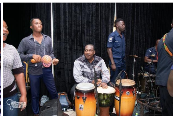
A Minister showing his drumming skills and having fun