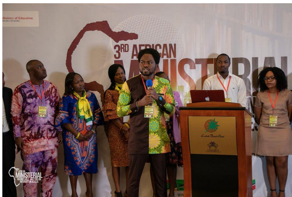
Young Library Professionals making a presentation at the Library Ministers

The Director of Research and the Research Coordinator of AfLIA also gave an insight on the ALVA Data Project – Now and the Future TASCHA/AfLIA . Opportunity was also given to the Young Library Professionals to share knowledge and ideas at the ongoing 3rd African Ministerial Roundtable meeting. The Young Library Professionals made a fantastic presentation on AU 2063 Agenda, Libraries and Pathways for creating the Africa We Want .