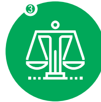
Aspiration 3 An Africa of Good Governance. Democracy, respect for human Rights, Justice and the Rule of Law.