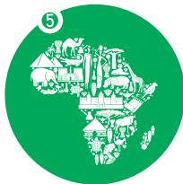
Aspiration 5 Africa with a Strong Cultural Identity Common Heritage, Values and Ethics.