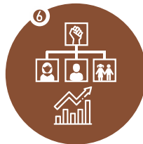
Aspiration 6 An Africa Whose Development is people driven, relying on the potential offered by African People, especially its Women and Youth, and caring for Children.