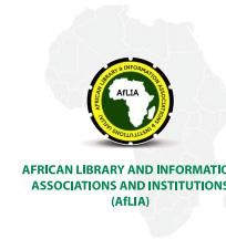
AFRICAN LIBRARY AND INFORMATION ASSOCIATIONS AND INSTITUTIONS (ALIA)