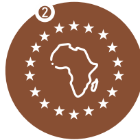
Aspiration 2 An Integrated Continent Politically united and based on the ideals of Pan Africanism and the vision of African Renaissance.