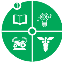
Aspiration 1 A Prosperous Africa, based on Inclusive Growth and Sustainable Development.