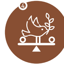
Aspiration 4 A Peaceful and Secure Africa