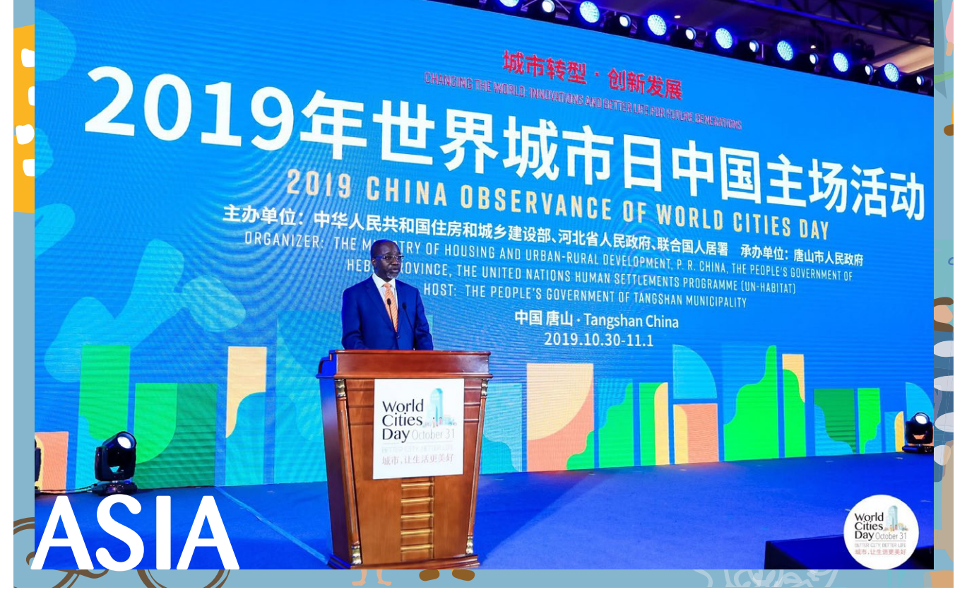
UN-Habitat Deputy Executive Director Victor Kisob addresses 2019 China Observance of World Cities Day in Tangshan City