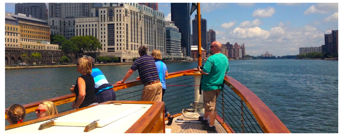
AIANY Urban Ecology Boat Tour

AIA New York and Classic Harbor Line organized the first-annual boat tour through the Hudson, East River and Harlem River, focusing on issues of urban ecology. The circumnavigation of Manhattan explored the green infrastructure designed to both restore the health and productivity of the region's marine ecology and to create resilient edges to mitigate storm surge and sea level rise. Guests heard accounts of the abundant marine life documented by 17th century explorers and learned how subsequent settlement patterns and resource overuse led to the estuary's decline. NYC today's ecological goals, including efforts to rebuild native oyster habitat and create sanctuaries for migratory fish and waterfowl, embody a renewed commitment to restoring native ecology along our shared urban shoreline.