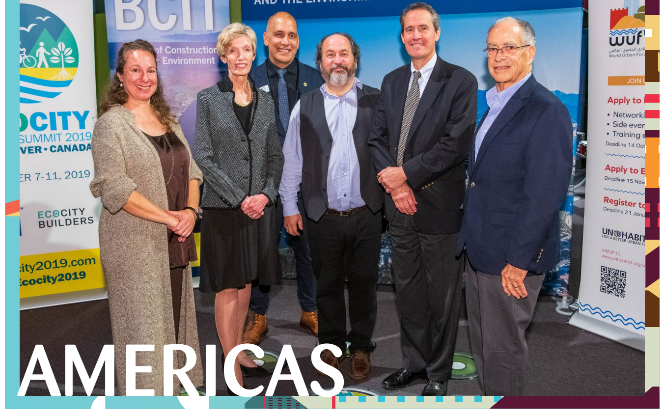
Keynote speakers at the World Habitat Day celebrations at the Ecocity World Summit Vancouver, Canada