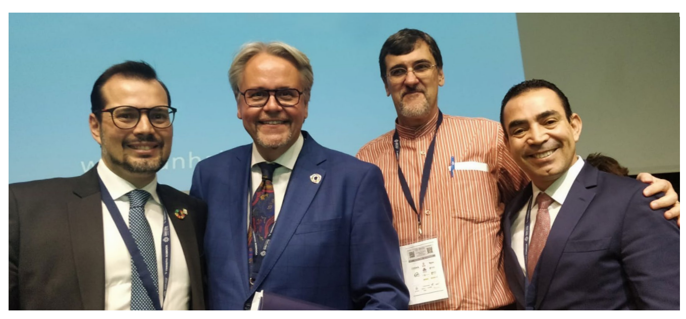
Participants at the UN-Habitat organized session at the ISWA World Congress in Bilbao, Spain to mark World Habitat Day

Seville hosted a meeting organized by the Office of UN-Habitat in Spain and FEMP in collaboration with the City of Seville, AACID, FAMSI and Ecoembes with the presence of Ecologists in Action and the mayors of Fuenlabrada and Cazorla. The event discussed and shared problems and possible solutions about this year's theme, "Cutting-edge technologies as a tool to convert waste into wealth."