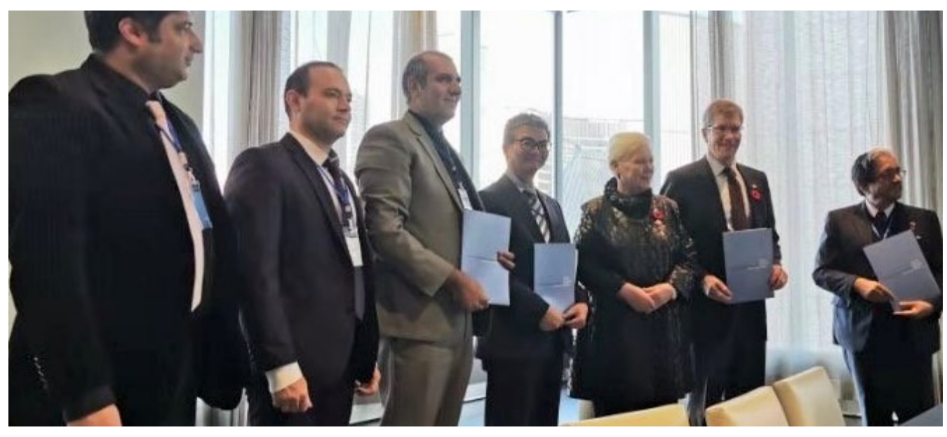
The inauguration of the Urban Economy Forum, in collaboration with UN-Habitat and International City Leaders in Toronto Canada on 28 - 29 October 2019.

The Prime Minister of Canada Justin Trudeau's statement said the "event brings together community leaders and financial stakeholders to discuss ways in which to build a sustainable urban economy."