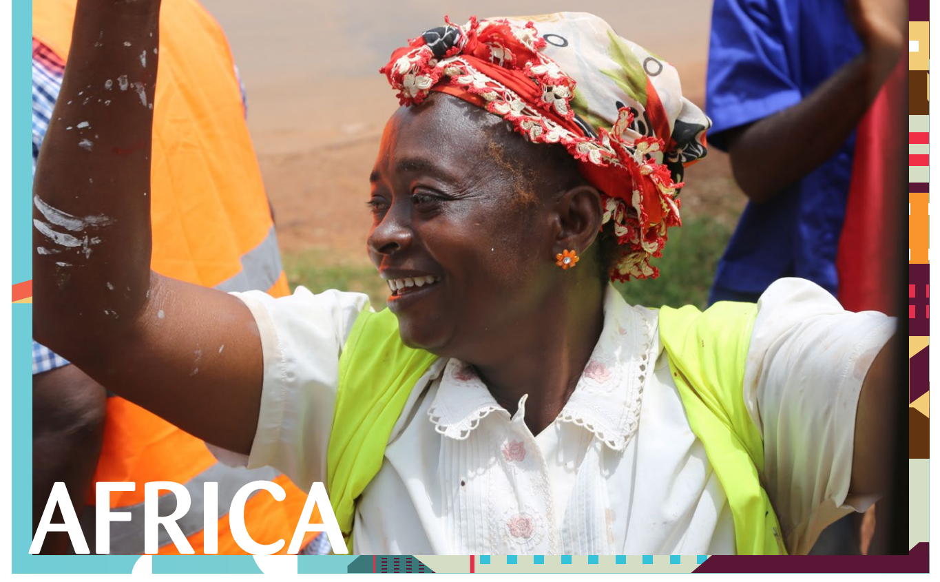
A woman joins her neighbours to celebrate jury members at the clean up in Yaounde, Cameroon.