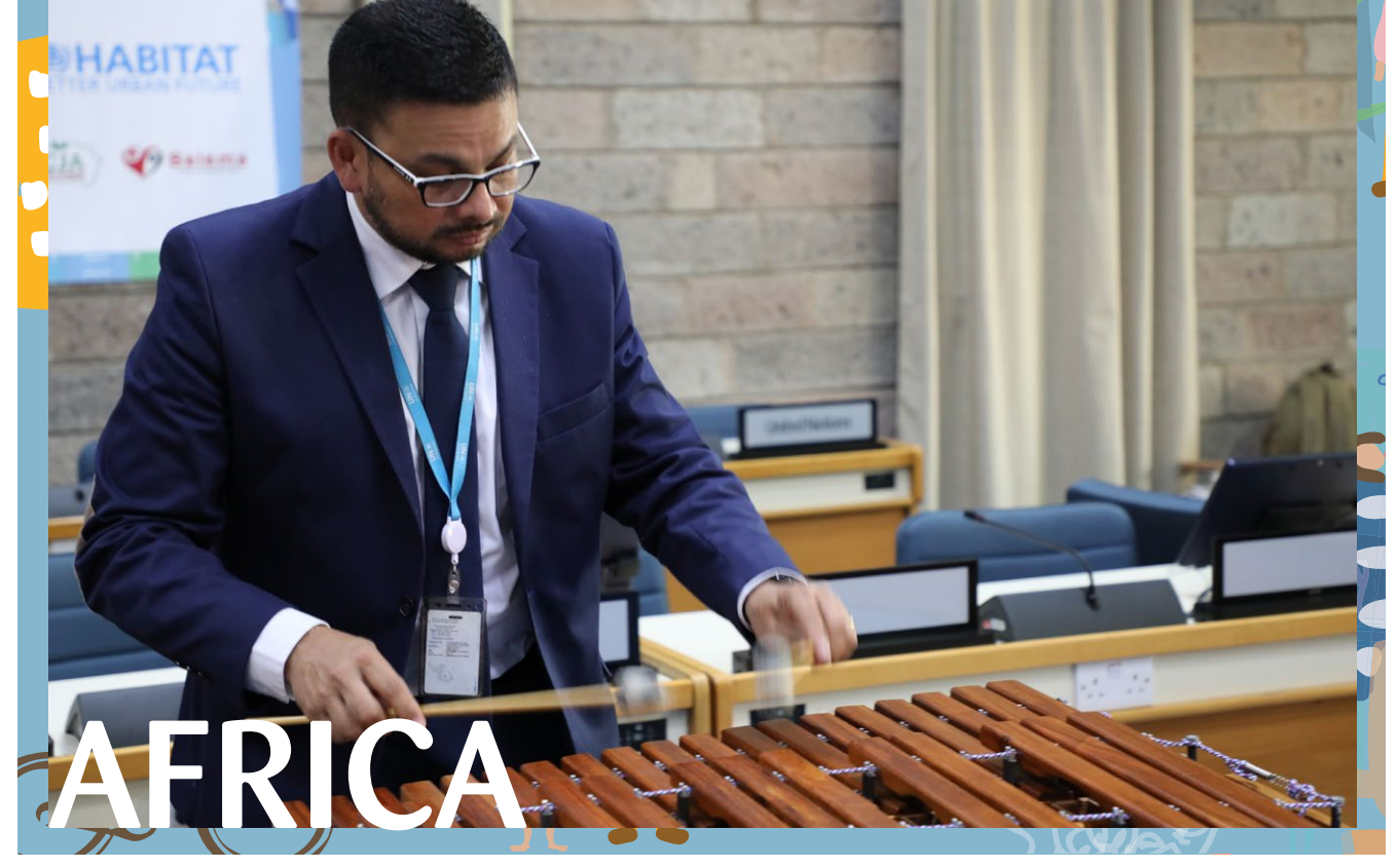
World Cities Day celebrations at the United Nations Office at Nairobi (UNON)