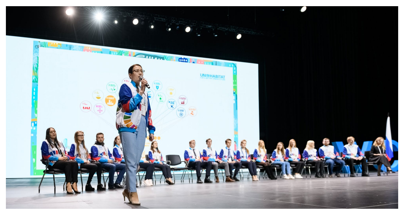
Youth ambassadors report back on their pre World Cities Day event

"The engagement of youth in shaping our future is critical," she said.