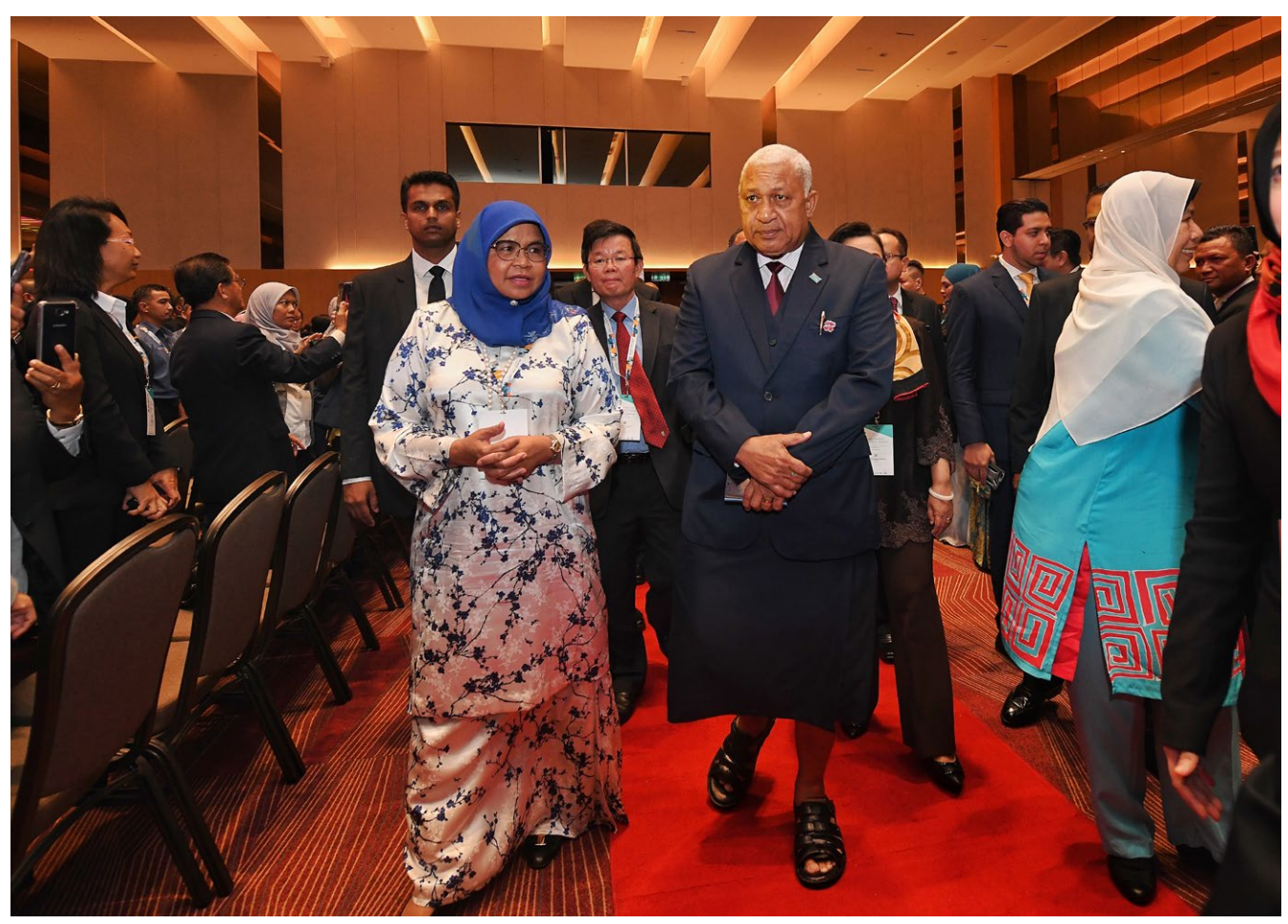
The UN-Habitate Executive Director with the Prime Minister of Fiji.

The 14 founding members of the Penang Platform are 100 Resilient Cities, Penang Island City Council, CityNet, Asian Coalition for Housing Rights, Commonwealth Local Government Forum, European Union International Urban Cooperation Programme (IUC), Huairou Commission, ICLEI-Local Governments for Sustainability, Institute for Global Environmental Strategies Japan (IGES), The Rockefeller Foundation, United Nations Development Programme, UN-Habitat, ESCAP and Urbanice Malaysia.