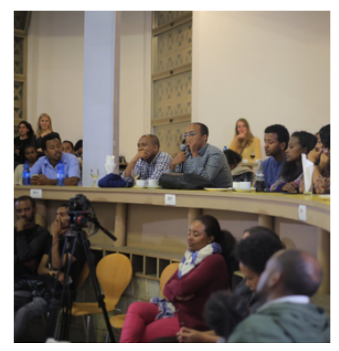
The Urban Dialogues in Addis Ababa promoted the engagement of Academia, Government and Civil Society stakeholders in critical issues for Ethiopia's urbanization

It was the first time that UN-Habitat organized a series of such events in Ethiopia and it brought a lot of visibility to the urban issues and selected themes, allowing the engagement of the civil society.