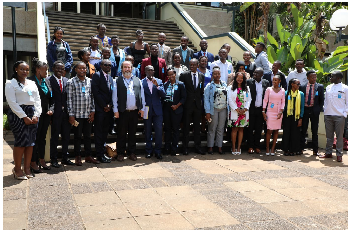
World Cities Day celebrations at the United Nations Office at Nairobi (UNON)