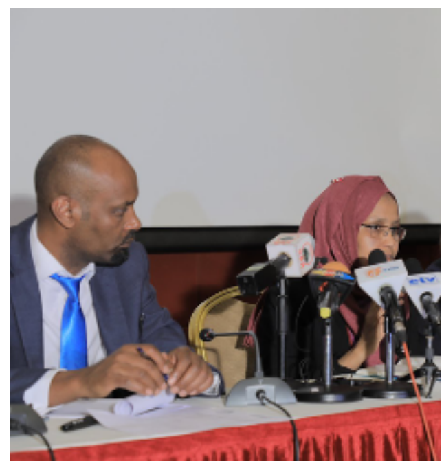
Inaugural speech of the Minister of Urban Development and Construction during the launching of the New Urban Agenda's Partner Platform in Ethiopia.