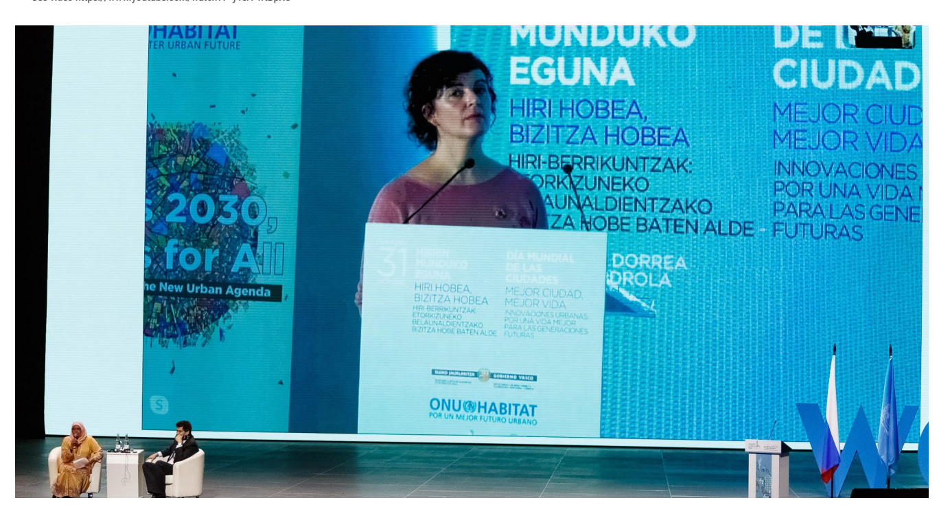
A live link up between World Cities Day in Bilbao, Spain and the Global Observation in Ekaterinburg, Russia on 31 October 2019.