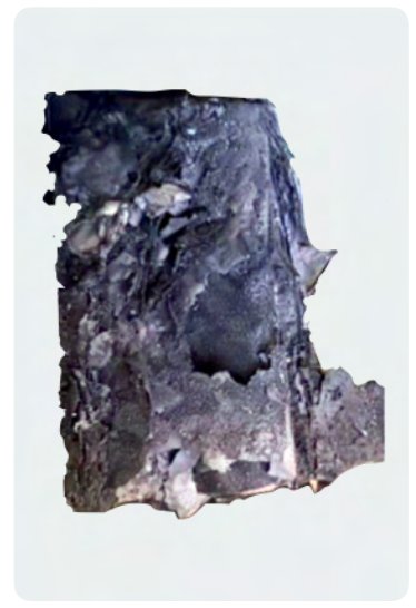
Third-party battery after an Abusive Overcharge test, which is intended to simulate charging the battery beyond its intended limits.