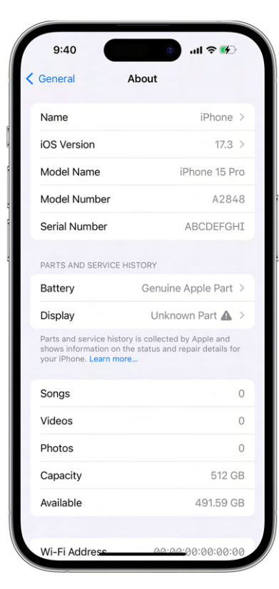
A Parts and Service History section in iPhone settings will appear if a user's iPhone has undergone repair.

If a user's iPhone has undergone repair of a major component, a Parts and Service History section will appear in their iPhone settings. If the service was completed using genuine Apple parts and calibration was successful, the user will see a "Genuine Apple Part" message. If the service was completed with a third-party part or calibration was not successful, they will see an "Unknown Part" message. Not having this messaging would result in consumers being unaware of prior repairs that could potentially compromise functionality or threaten user safety and security.