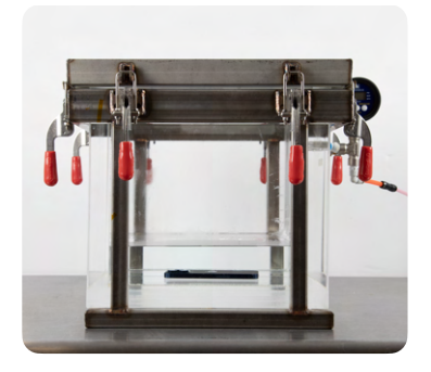
To test for IPX7/8 water immersion protection, Apple submerges iPhone inside a pressurized vessel to simulate pressure experienced underwater.