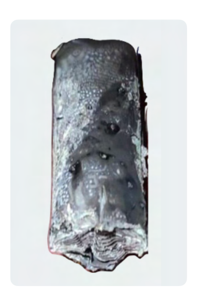
Third-party battery after an External Short-Circuit test, which is intended to simulate an unintended circuit fault.

While Apple does not disable the use of third-party batteries, transparency is critical. It is important to notify consumers when a third-party battery is installed so they are aware of the potential risk to their safety.