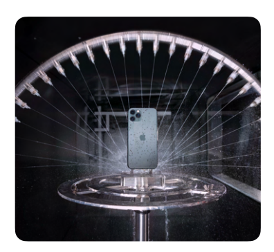
To test for IPX3/4 water resistance, Apple uses a swing arm with nozzles to simulate water spraying or splashing on iPhone.

For example, early generations<sup>6</sup> of iPhone were susceptible to failure if exposed to liquids like accidental spills, getting caught in the rain, or drops in water — so our design teams iterated until they were able to achieve robust liquid ingress protection, which decreased repair rates by 75% with iPhone 7 and iPhone 7 Plus. While these changes required the addition of adhesives, seals, and gaskets that made repairs more complex, the remarkable improvements to product longevity justified a slight increase in repair complexity. The reliability of our hardware will always be our top concern when seeking to maximize the lifespan of products. The reason is simple: the best repair is the one that's never needed.