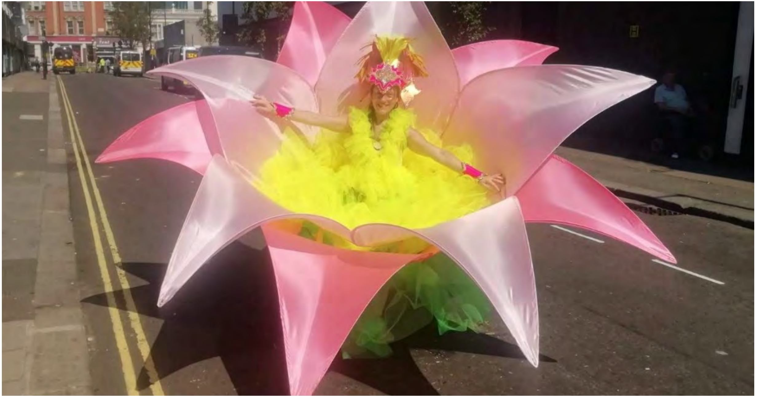
Notting Hill Carnival 2019, Notting Hill Carnival