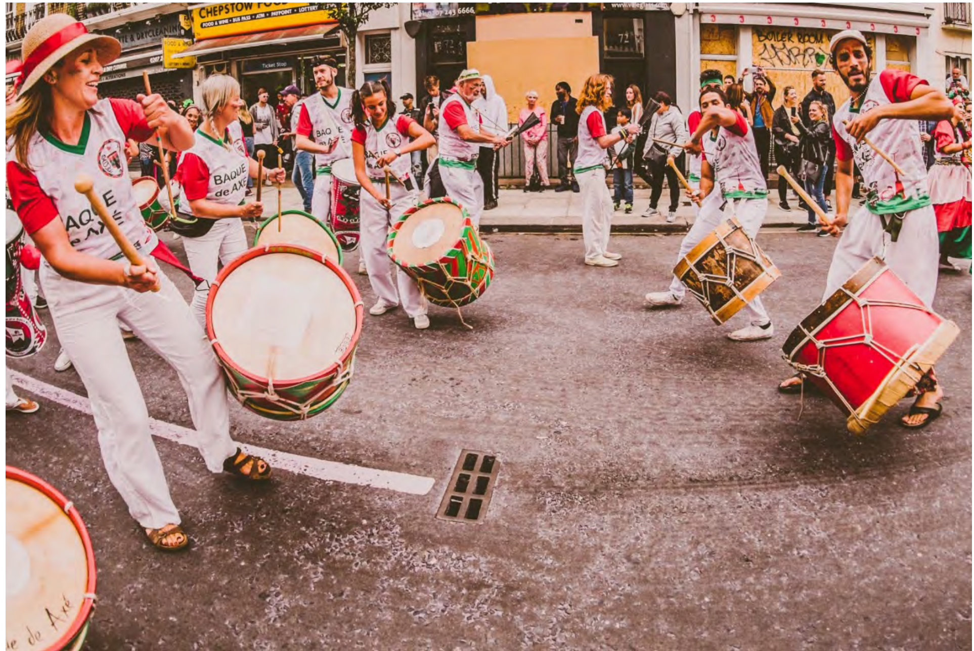
Brazilian Band, Notting Hill Carnival