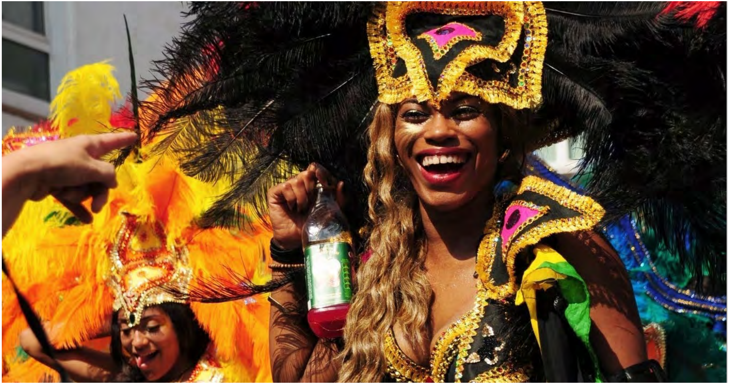
Notting Hill Carnival 2013, Notting Hill Carnival