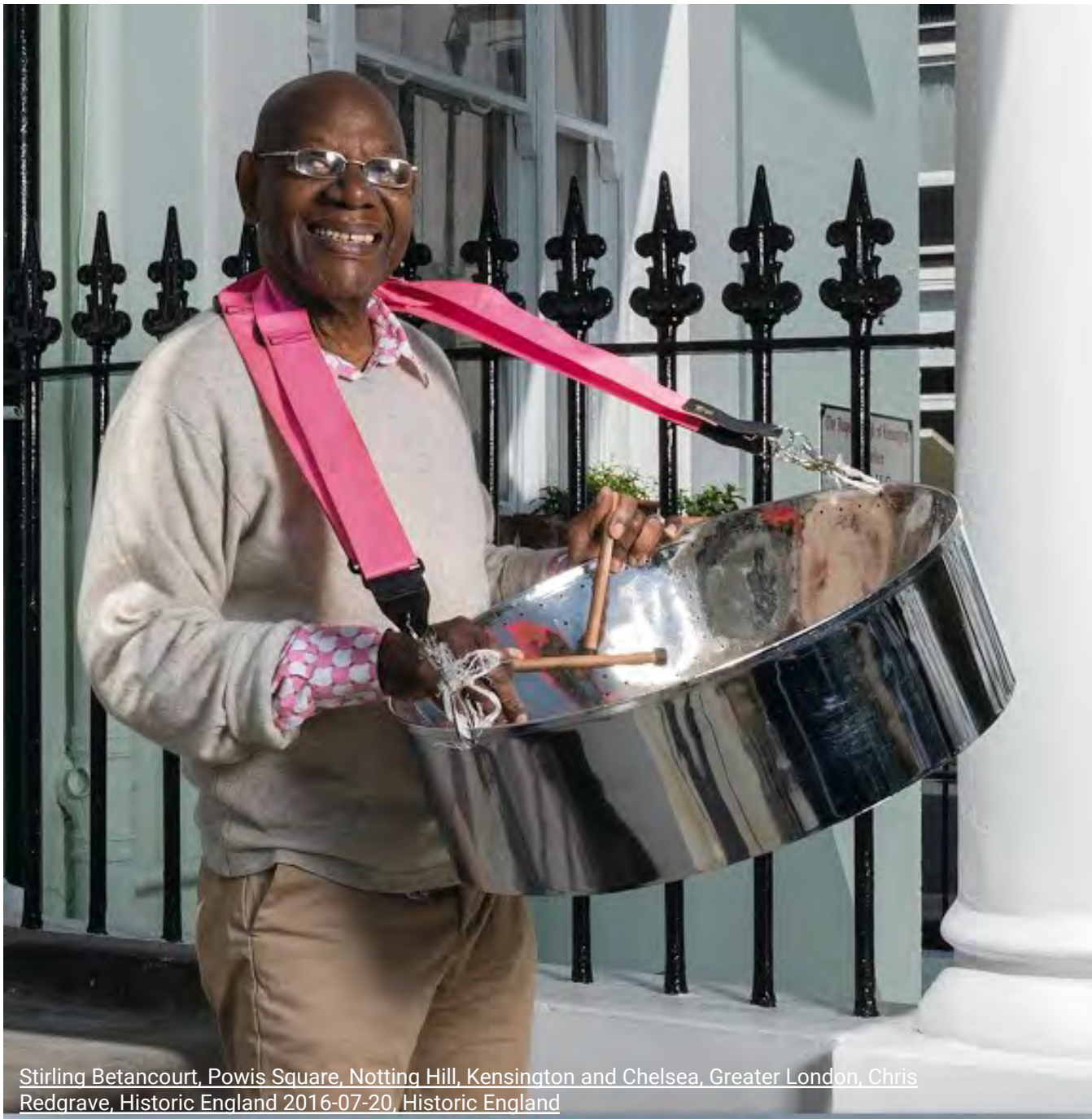
Stirling Betancourt, Powis Square, Notting Hill, Kensington and Chelsea, Greater London