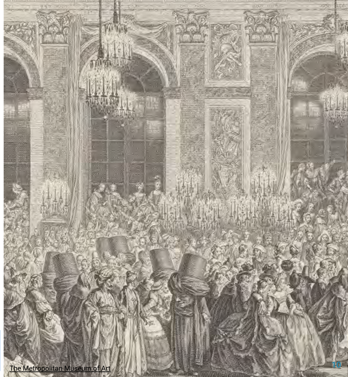
The Metropolitan Museum of Art

A French masquerade ball during the 1600s