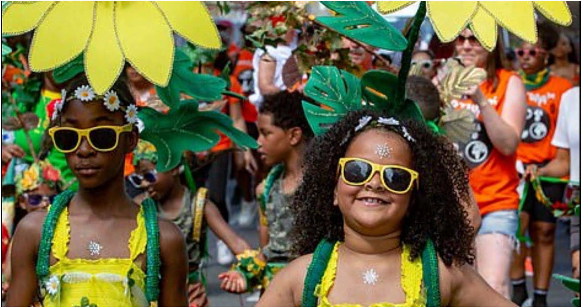
Notting Hill Carnival 2019, Notting Hill Carnival