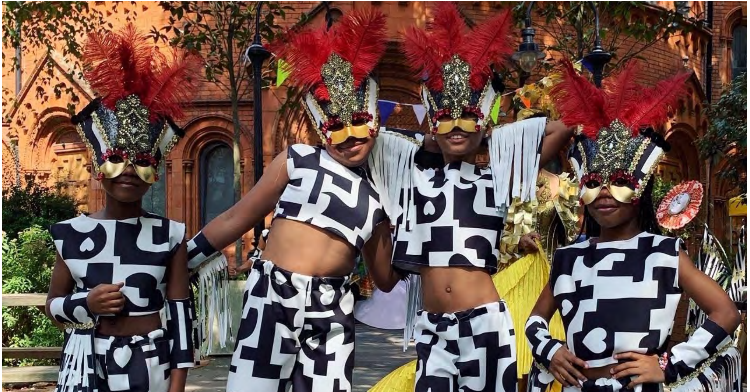
Elimu 2013, Notting Hill Carnival