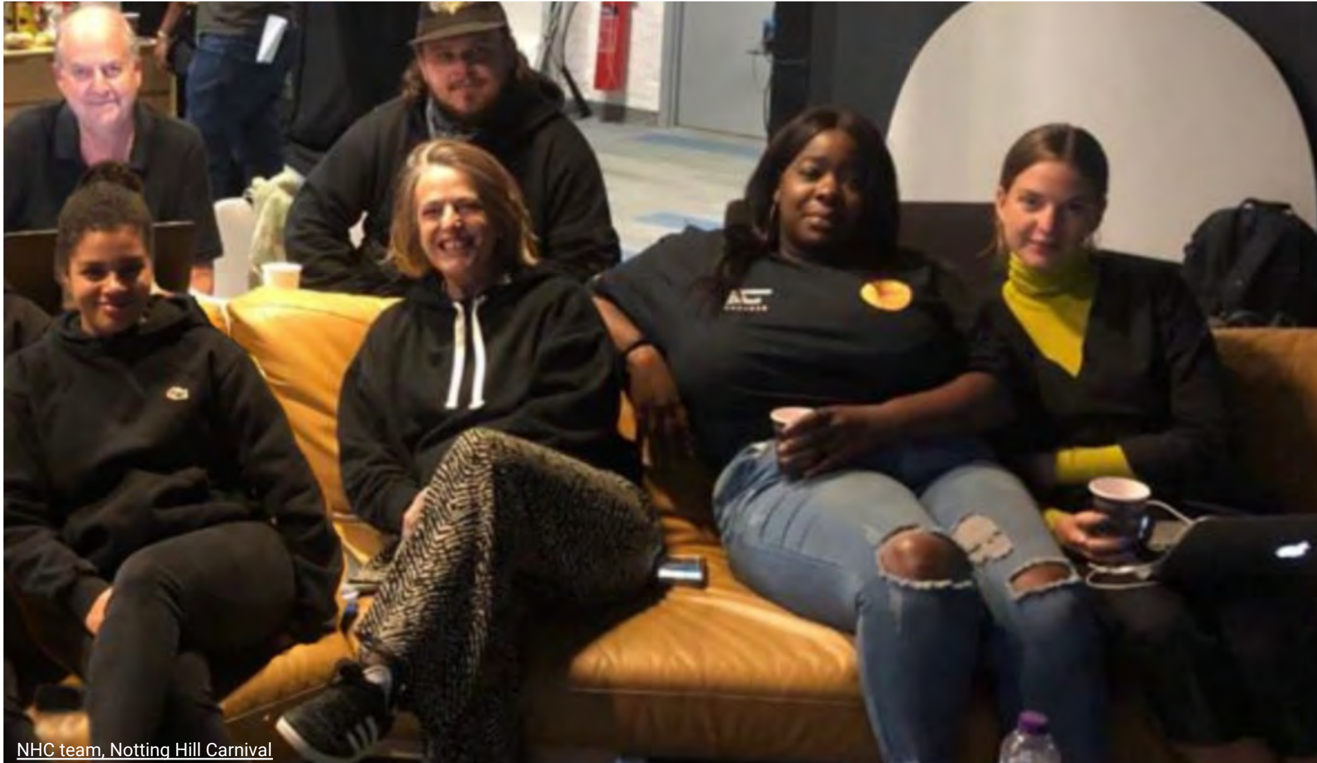
NHC team, Notting Hill Carnival

Notting Hill Carnival is put together by a dedicated team. Its members work throughout the year to arrange the artists, the music, the food, and more.