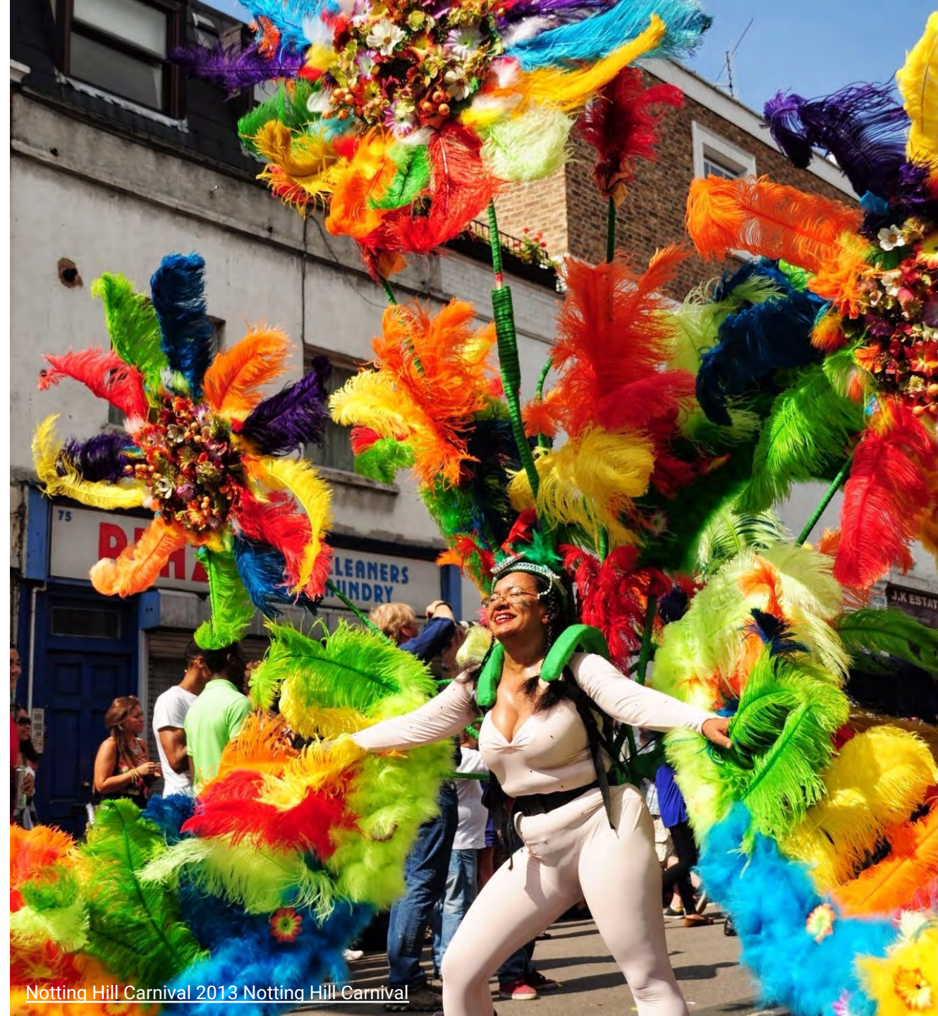
Notting Hill Carnival 2013 Notting Hill Carnival

See more images from Carnival and read more about the festivities at Notting Hill: The Culture of Carnival.