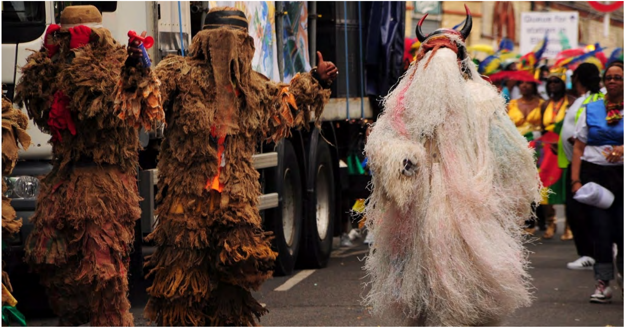
Notting Hill Carnival 2011, Notting Hill Carnival