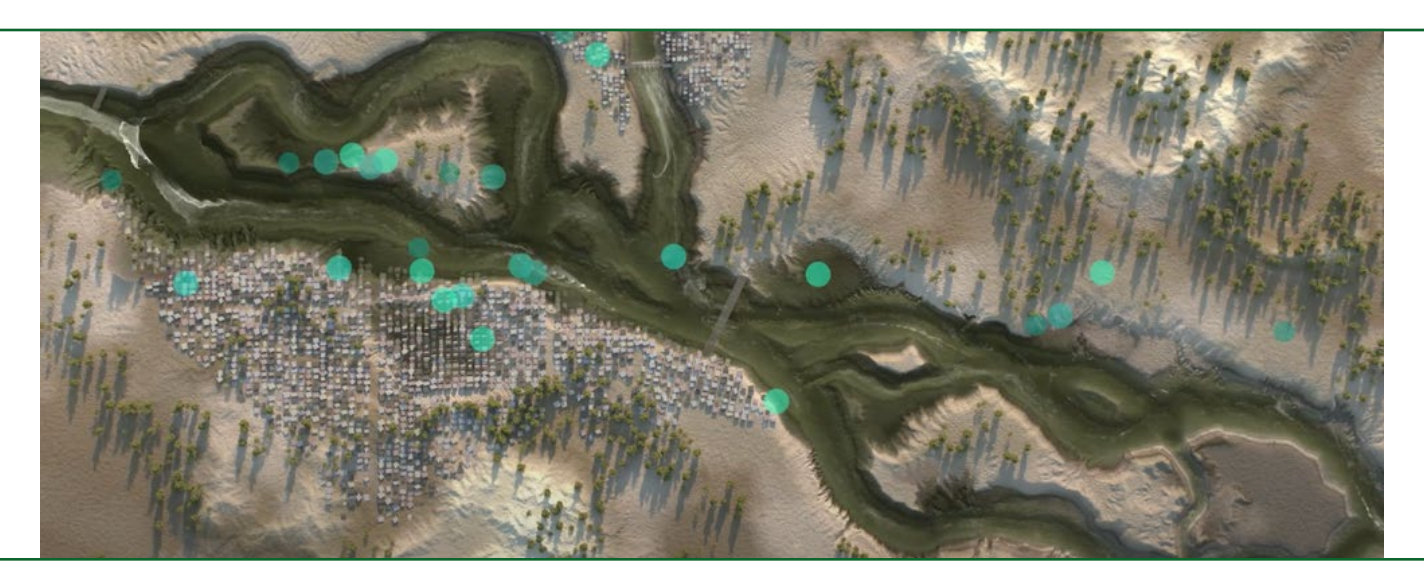
Flood Hub, a Google Research initiative on flood forecasting, provides actionable information to help people and communities stay safe