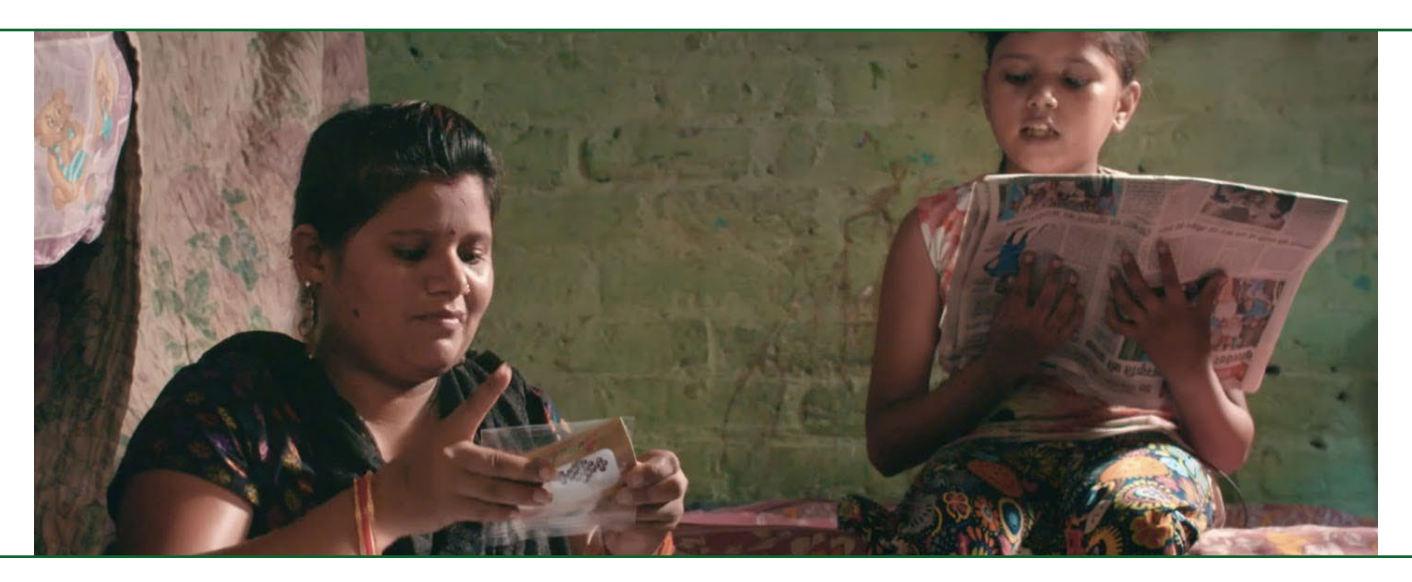
Read Along, Google's speech-based reading tutor app, allows students to learn by reading aloud