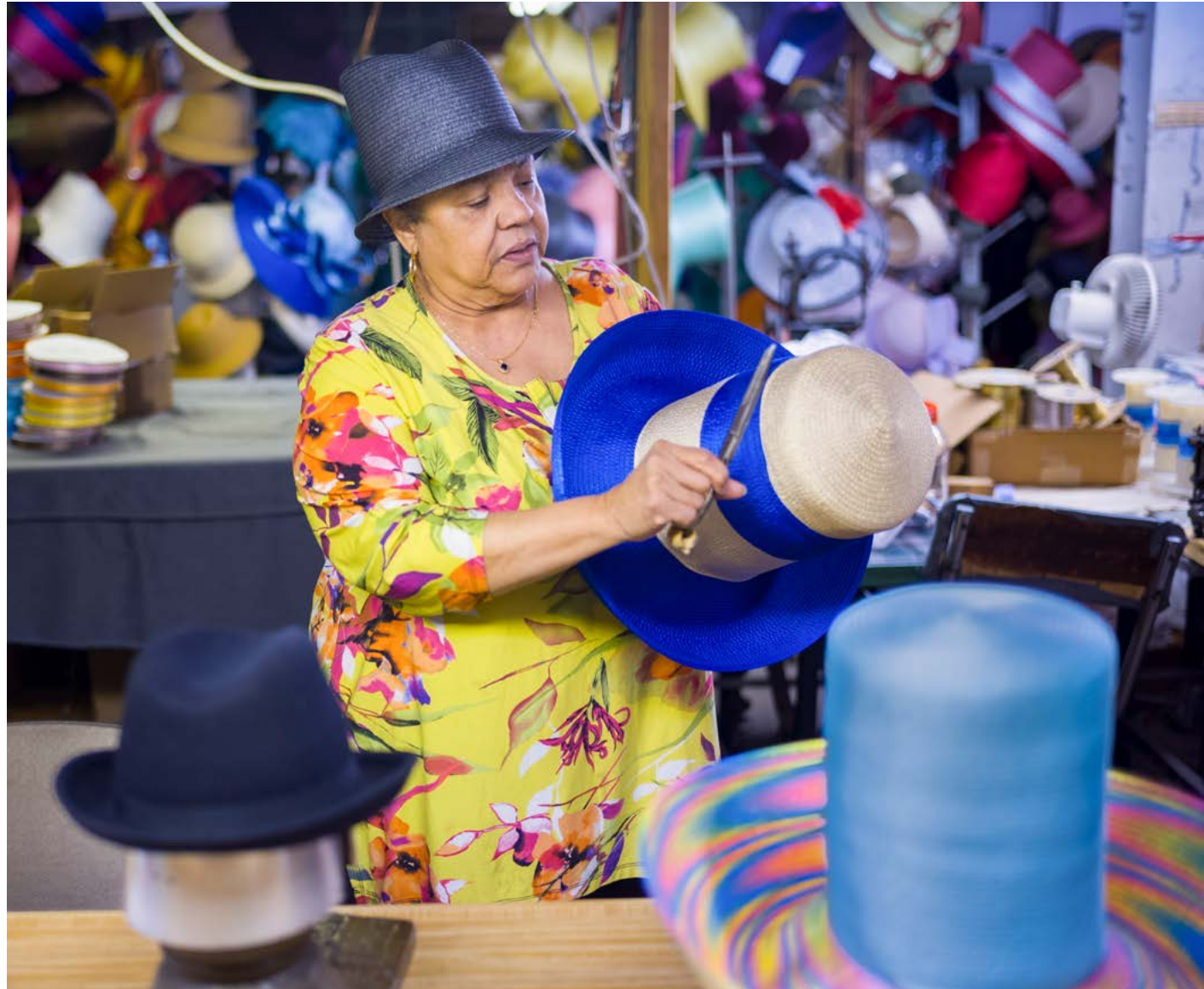
American Hats | Philadelphia, Pennsylvania

Explore Google's economic impact in your state, and see how businesses across the country are using Google tools to succeed online and grow.