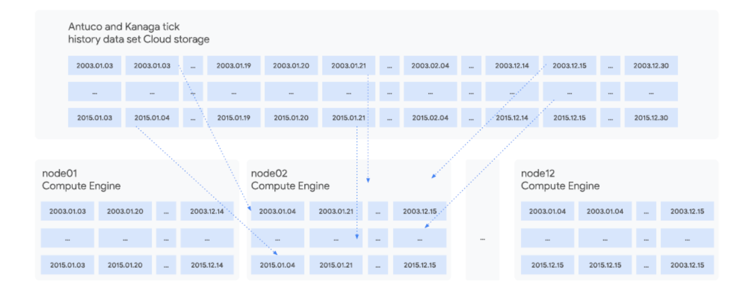
Figure 2. STAC-M3<sup>™</sup> sharded data set.

Not only was each node responsible for downloading its own range of the entire data set, each range consisted of multiple files which could be downloaded in parallel to the local file systems of each node. This parallelism, both across and within nodes, was the key to optimizing the data transfer.