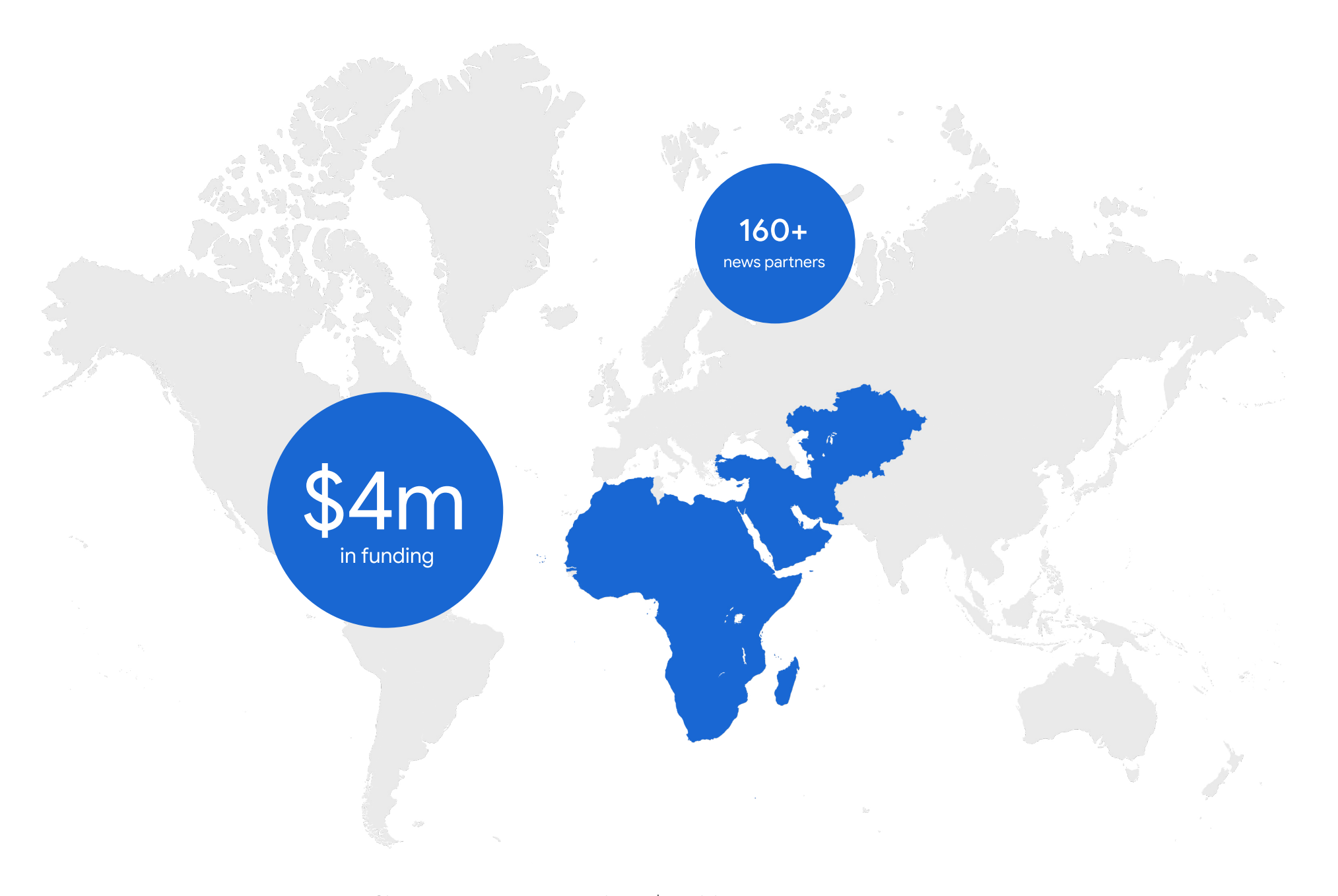
Since 2018, we've committed $4 million to support 160+ news partners in 30 countries in Middle East and Africa