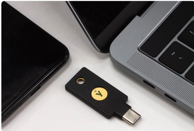
YubiKeys deliver strong user authentication across platforms and devices

Yubico is the principal inventor of the WebAuthn/FIDO2 and Fido U2F authentication standards adopted by the FIDO Alliance and is the first company to produce the U2F security key and a multi-protocol FIDO2 authenticator.