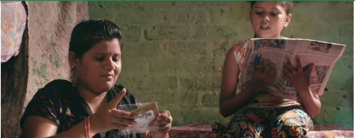
Read Along, Google's speech-based reading tutor app, allows students to learn by reading aloud